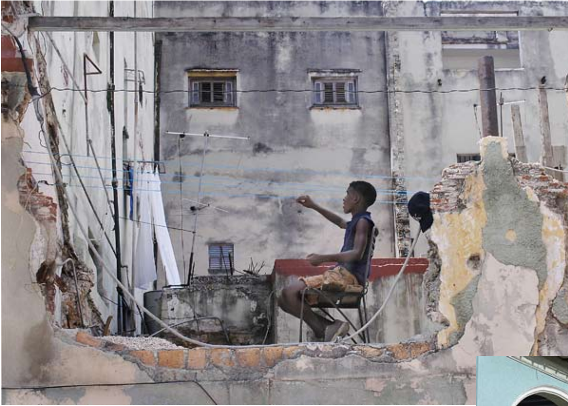
A young boy plays ball against the wall of a gutted building slated for restoration.