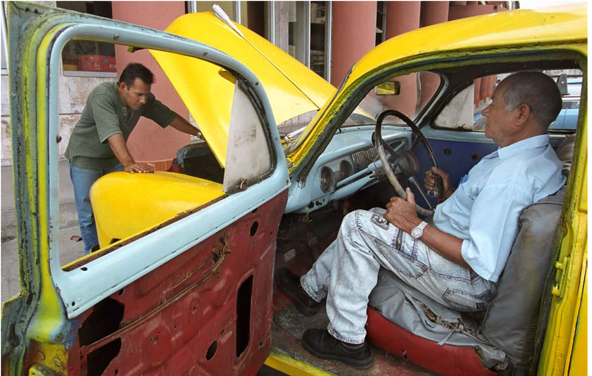
Two men try to fix a broken down car. These old vehicles are so closely associated with our image of life in Havana.