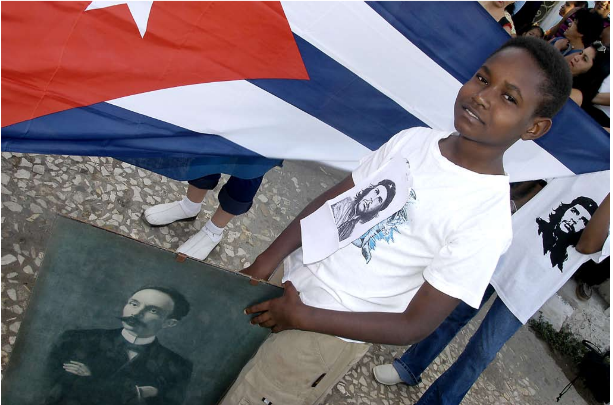
A young boy holds a portrait of Jose Marti on a day of national celebration. Pinned on his shirt is the image of Che Guevara. Behind him, another holding up the Cuban flag wears a T-shirt with the image of Che.