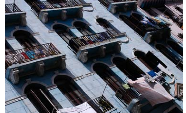
A restored section of La Habana Vieja beautifully reflects the light of the afternoon sun.

In 1982, La Habana Vieja (the old colonial section of the city) was declared by UNESCO a World Heritage Site. Because of that, millions of dollars have poured in for restoration. However, the US Embargo, poor management and an economy that collapsed after the Russians pulled out have left a good deal of the city in disrepair. Even with these problems the city is filled with many historical monuments and the exuberant friendliness of the Cuban people.