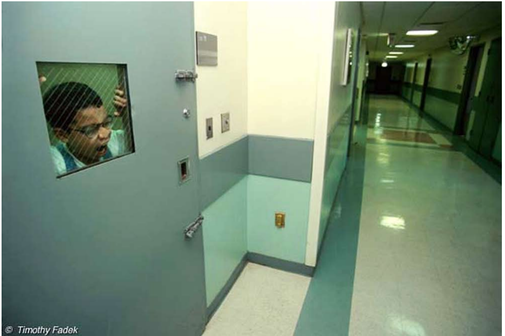
Lorenzo demands to be let out of the padded “quiet room.”