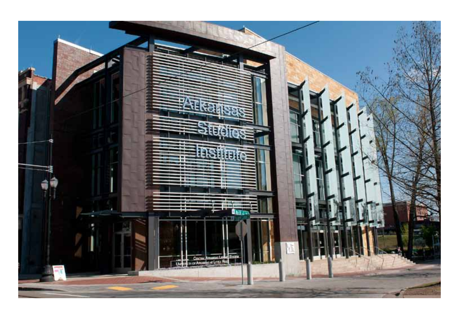
The opening reception was March 31 from 5-8 p.m.