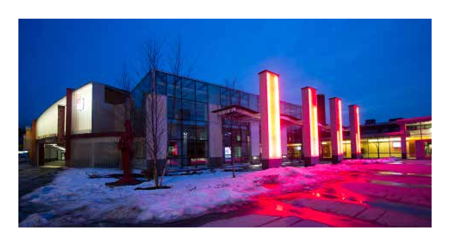
Edgerton Arts Center Gallery February 12 - March 12, 2014 & June 1- August 21, 2014