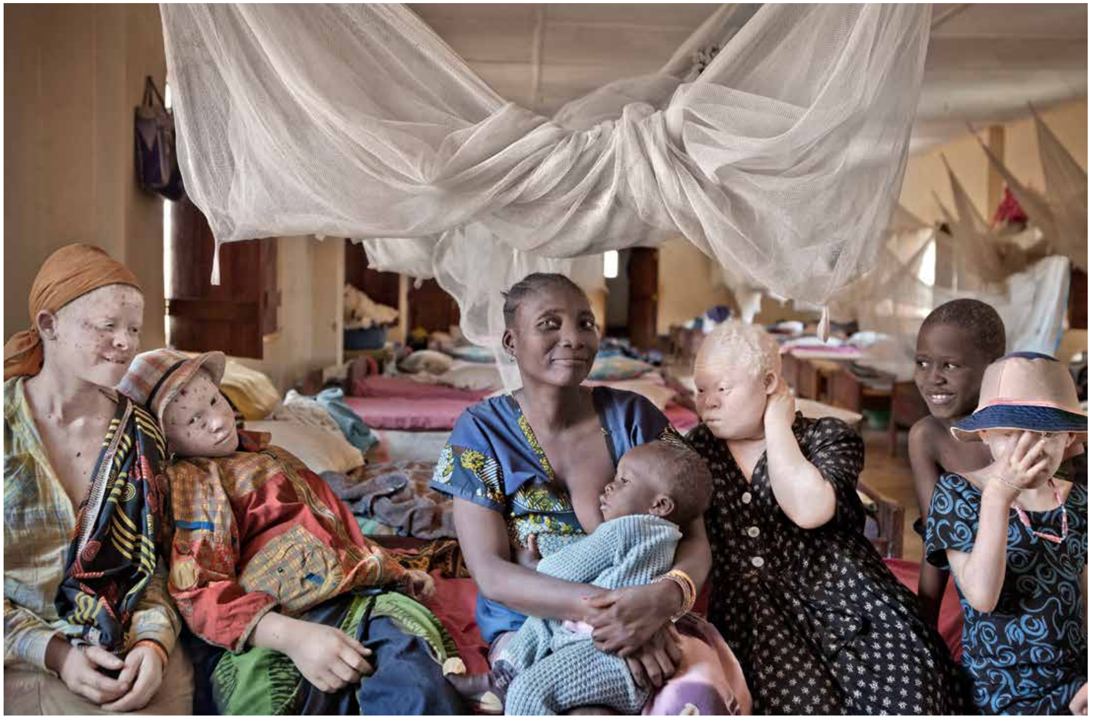
Children and a caregiver sit together in one of the dormitory rooms at Kabango.