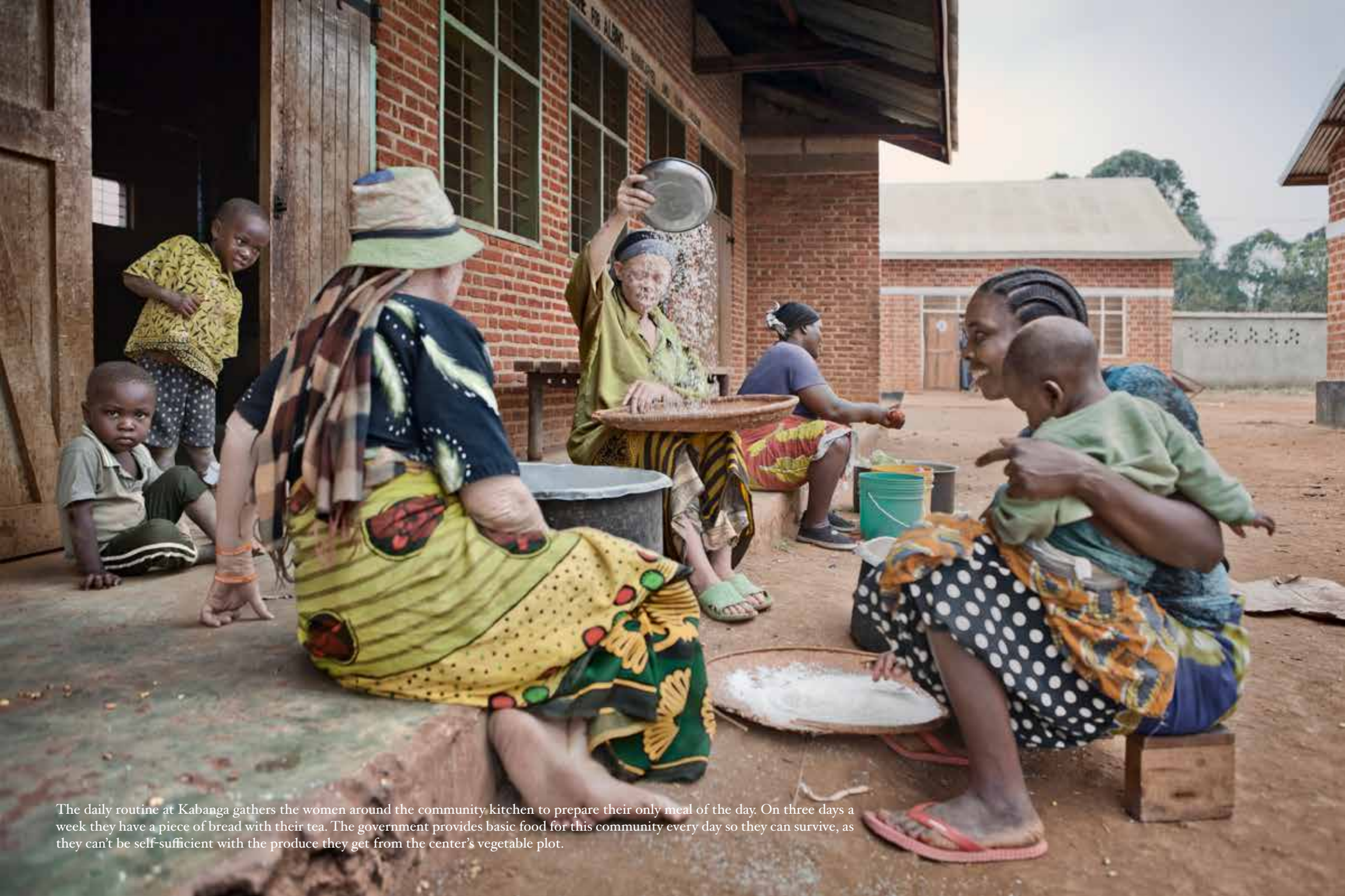
The daily routine at Kabanga gathers the women around the community kitchen to prepare their only meal of the day. On three days a week they have a piece of bread with their tea. The government provides basic food for this community every day so they can survive, as they can't be self-sufficient with the produce they get from the center's vegetable plot.