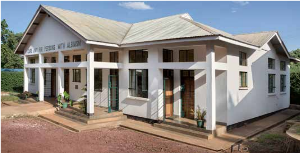
The Kilisun production laboratory, Kilimanjaro Sunscreen Production Unit, was opened in July 2013. In 2016 it distributes its products to two thousand three hundred people with albinism.

Getting a child to put on sun cream, and a hat and sunglasses every single day of his or her life is not easy. They may say they've put on cream when they haven't, the hats get lost, the glasses get broken. Like most children anywhere, children with albinism find the whole thing a nuisance. The difference is that for these kids, if they don't cover up they're likely to die before the age of thirty, which is the life expectancy of a person with albinism in Tanzania.