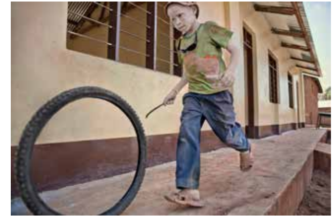
For a child a toy can be made out of anything. (top)

In Tanzania, nine out of ten people with albinism die of skin cancer before reaching the age of thirty. Although dermatologic services are improving year on year, they are still in short supply and expensive, beyond the reach of most people. The best treatment for skin cancer, in Tanzania as in the rest of the world, is prevention. But in Tanzania prevention is not simply a matter of rubbing on some protective cream on the sunniest days; people with albinism need to wear hats, sunglasses, and long sleeves every day. At the same time it is not easy for them to stay indoors, because children have to go to school, women have to walk long distances to collect water, and subsistence farmers