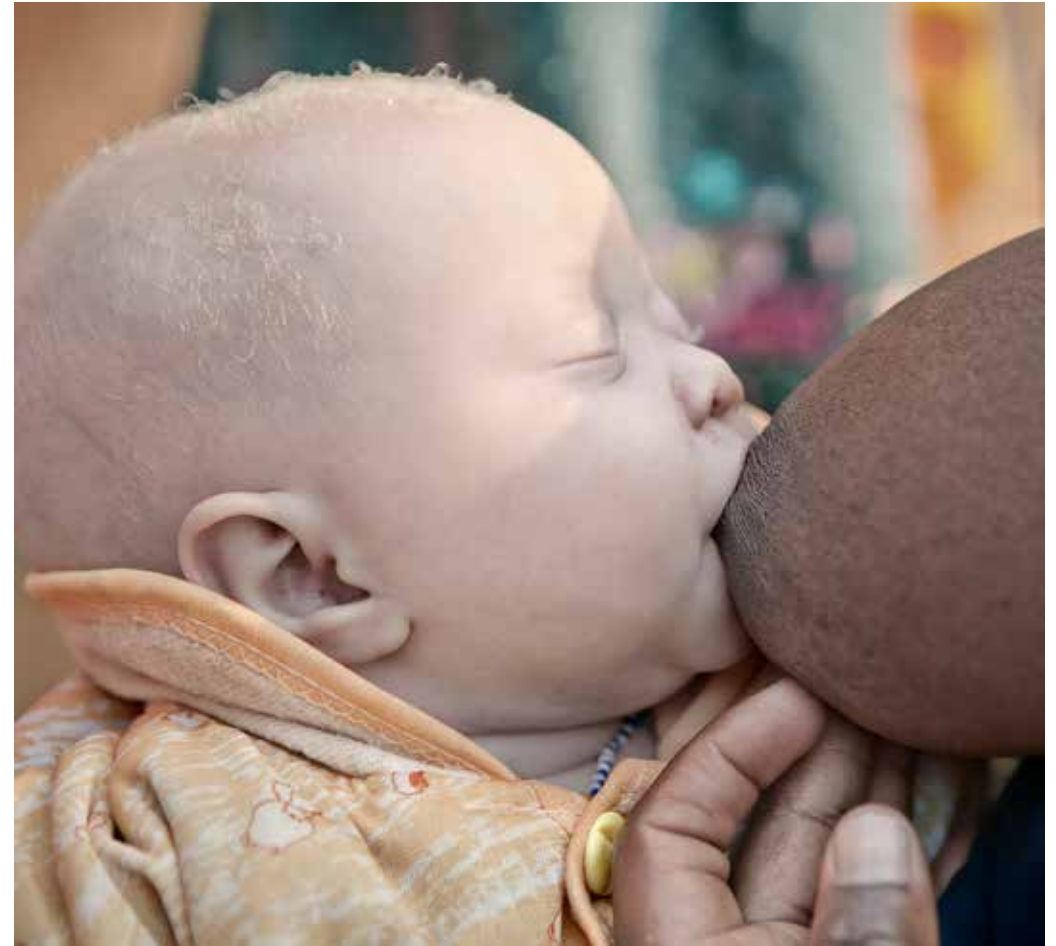
A mother nurses her child. Many women have to flee to complexes like Kabanga to seek protection when they give birth to an albino baby. The women who live at Kabanga take care of their own children and also act as "guardians" for other albino children who have been abandoned at the center.

This is just the first of a series of social disadvantages they will encounter in different stages of their life. Receiving little stimulus at home, they have difficulties in school because they can't see the blackboard properly, and most fail to reach secondary school.