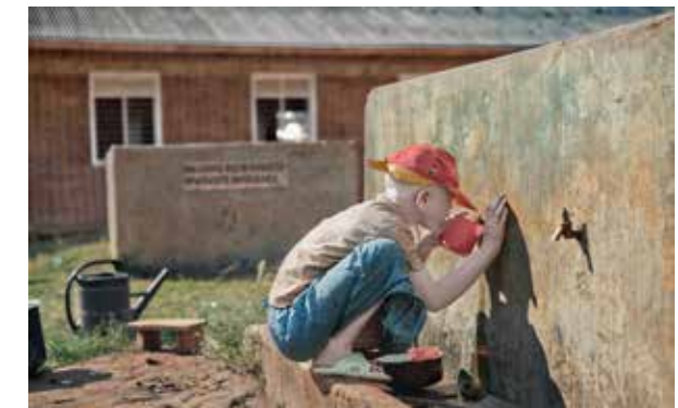
A child takes water from a communal fountain.

members of their own community and become adults with a grave lack of self-esteem, self-excluded from a society that does not accept them and which they in turn are unable to accept. In Tanzania these adults-cum-children do not finish their schooling and swell the 85% of the population living on less than a dollar-and-a-half a day. 2 This is another reason why education and the fostering of awareness in these communities are so important.