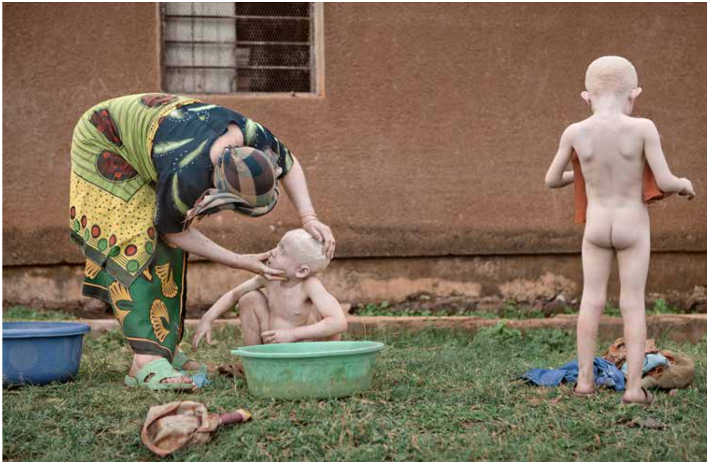
Bath time starts at sunset in Kabanga. This is the safest time of day when albino children can take their clothes off without being afraid of getting their skin sunburnt.

Many are thus deprived of access to a decent job. It is hard for them to find a partner, since their condition as “damned” beings scares others. Their own neighbors say that people with albinism do not die, they fade away, or that to touch one is to risk becoming white or falling ill. Living in such a social and cultural context is not conducive to self-esteem and some people with albinism experience the discrimination they are subjected to as natural.