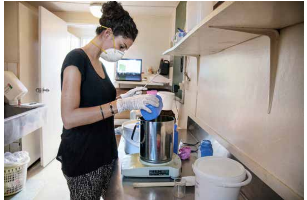
Until 2013, Kilisun was manufactured in a makeshift laboratory set up in a freight container, in quantities barely sufficient to provide sunscreen for two hundred people.

The team has also developed a training program in dermatologic surgery in the form of workshops. The workshops include a theoretical component in which the principles of skin cancer and possible therapeutic treatments are explained. These theoretical sessions are complemented by workshops in which dozens of patients with albinism are operated on. Local doctors participate actively in these operations, and over time acquire the necessary skills to carry out interventions without our help. 7