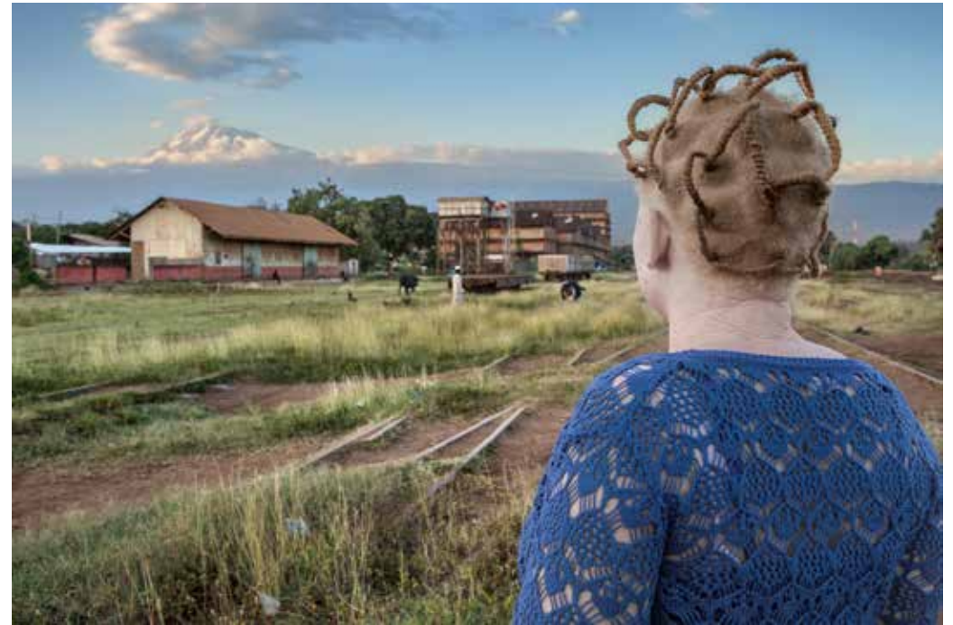
Kabanga. The Tanzanian government has found it necessary to set up special centers to protect people with albinism. Around a hundred albinos live at the Center.

Albinism, which seems so exotic in the West, is a deadly serious matter for those who suffer from it in Africa. It is a genetic condition consisting of a lack of pigmentation in the skin, eyes, and hair. It causes serious eyesight problems,