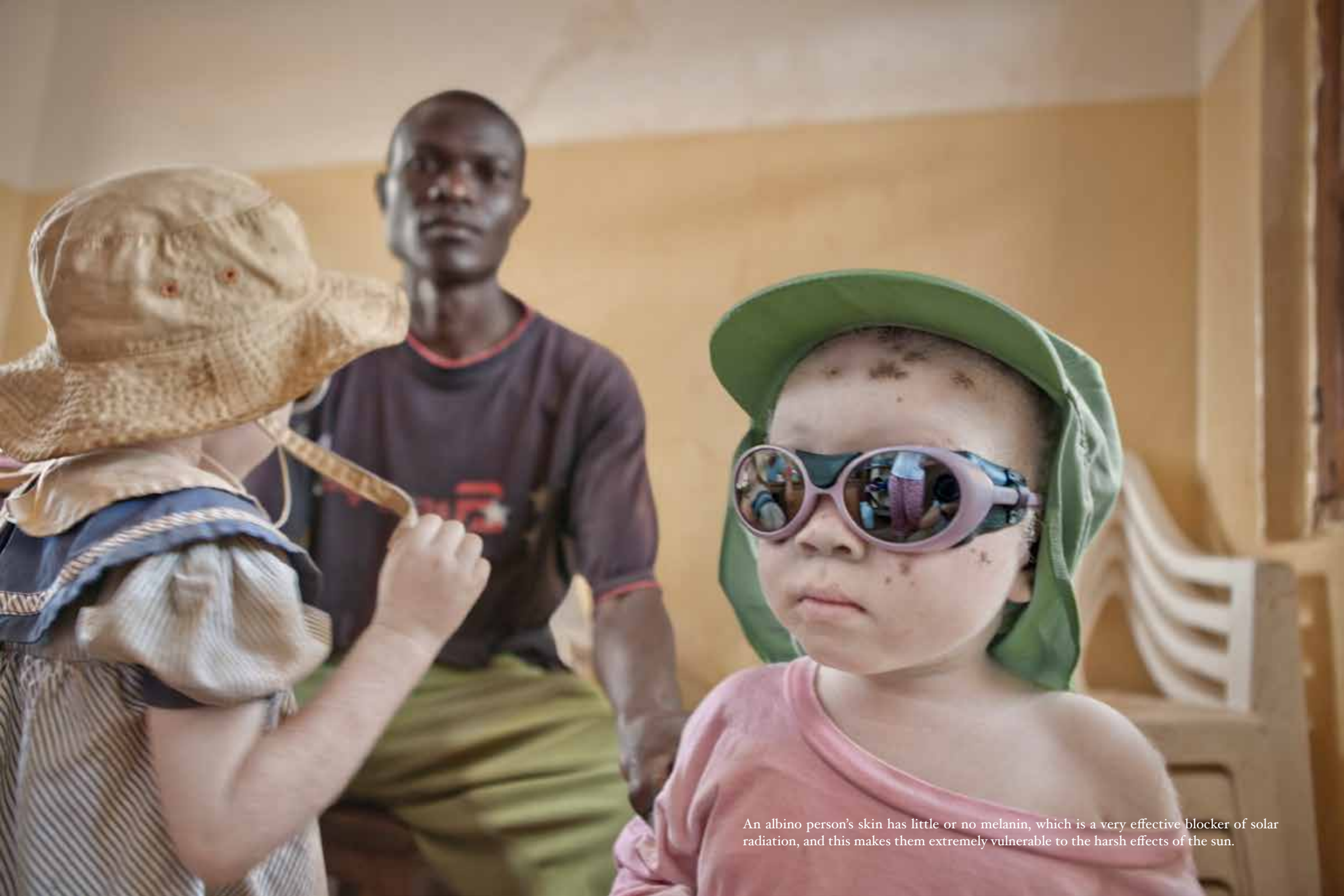
An albino person's skin has little or no melanin, which is a very effective blocker of solar radiation, and this makes them extremely vulnerable to the harsh effects of the sun.