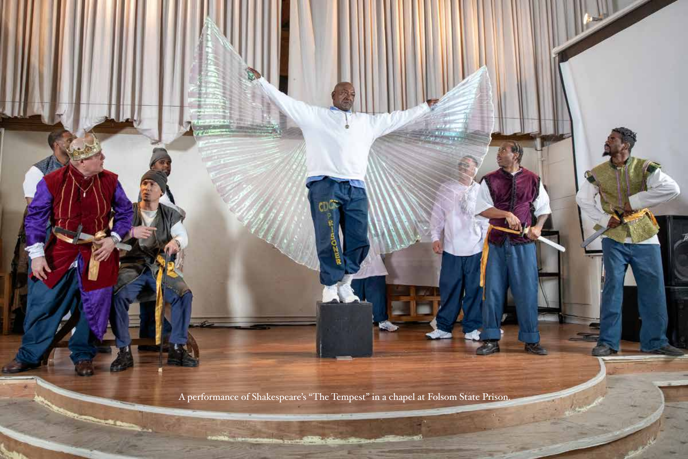
A performance of Shakespeare's "The Tempest" in a chapel at Folsom State Prison.