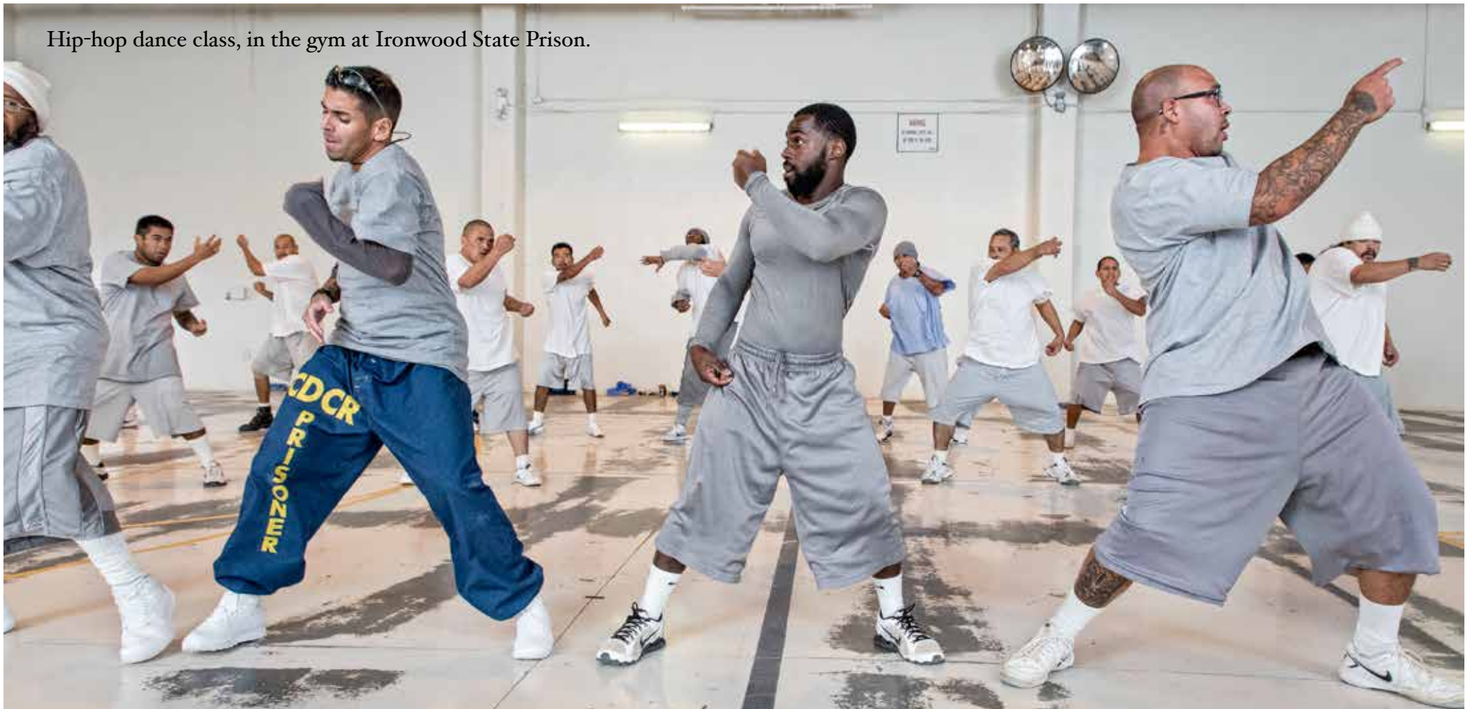
Hip-hop dance class, in the gym at Ironwood State Prison.