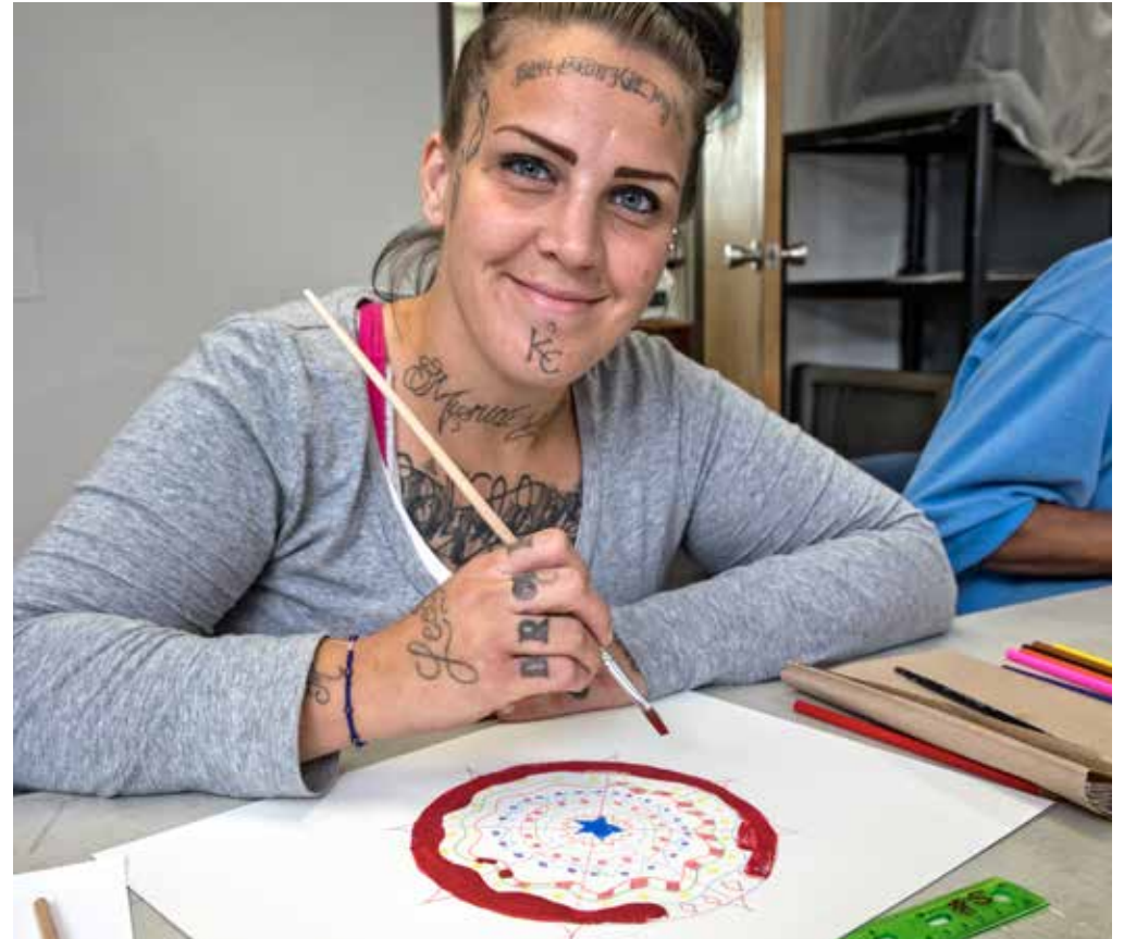
A student paints a mandala, during art class at California Institution for Women.