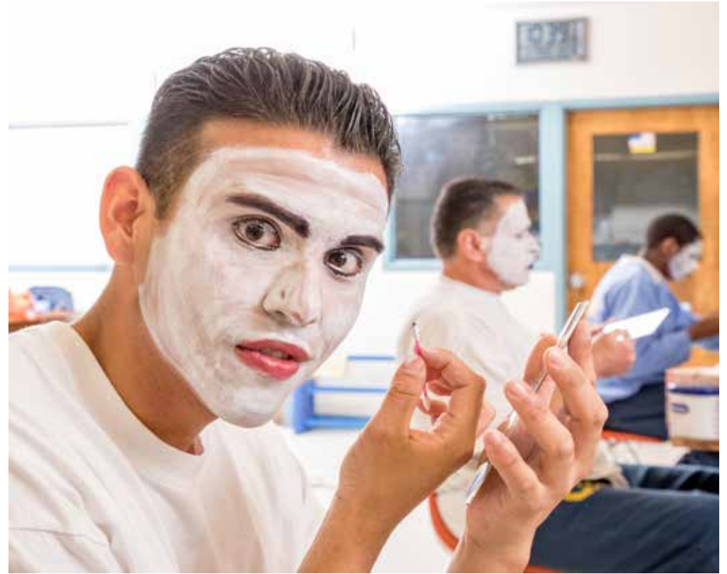
A theatrical student applies makeup prior to class, at CCI Tehachapi.

The primary mission of Arts-in-Corrections was to provide inmates with diverse opportunities to discover and develop their artistic skills