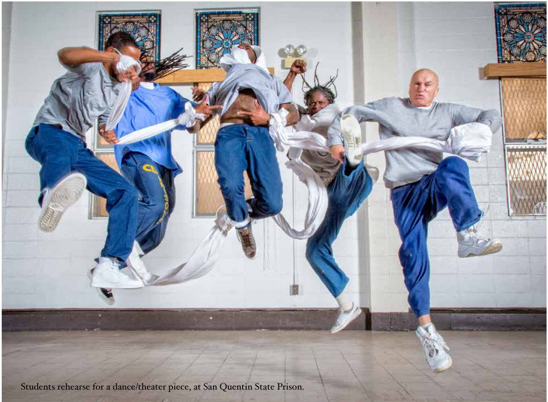
Students rehearse for a dance/theater piece, at San Quentin State Prison.