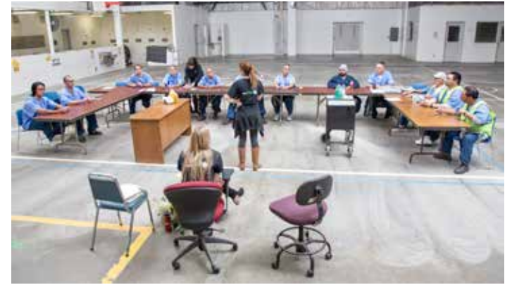
Painting class in the gym, at Donovan State Prison.