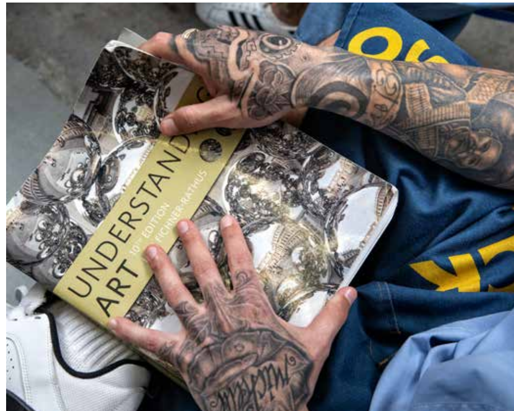
An art student with a textbook at Calipatria State Prison.

We begin with a heartfelt letter written by a mother whose son committed murder just before the start of his senior year at high school, as part of a gang initiation. She read this testimony before the 2013 California