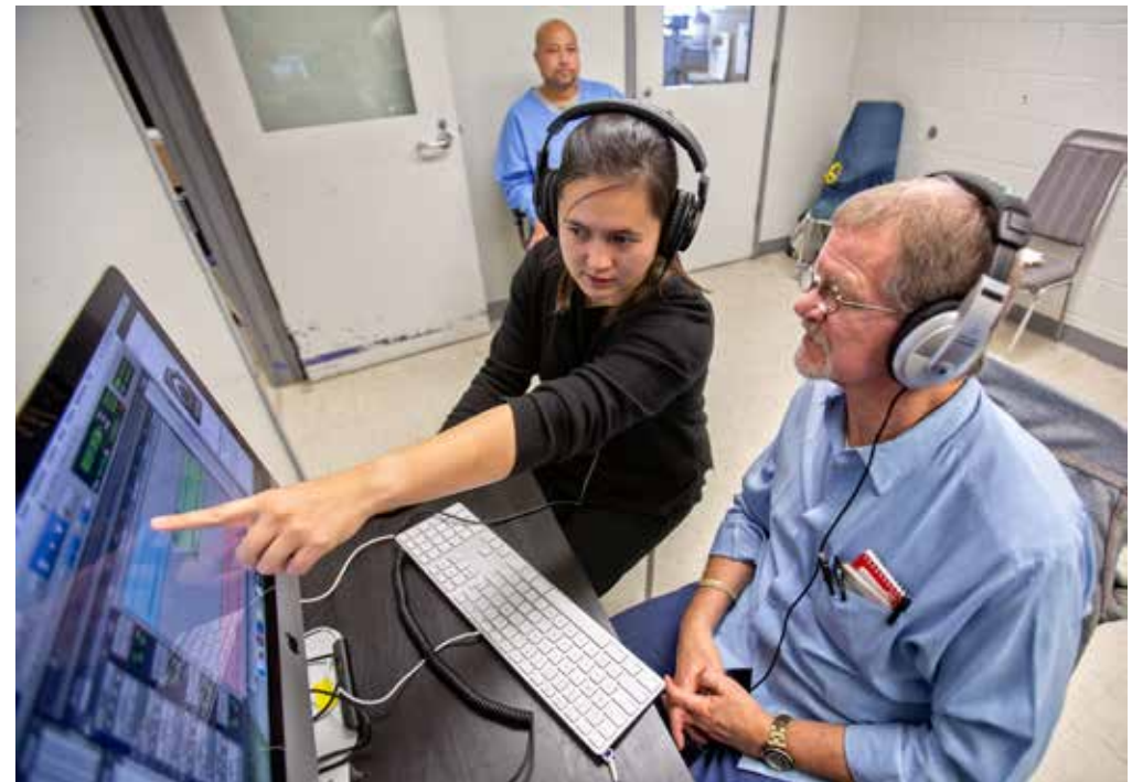
An instructor guides a student during an audio journalism class at Solano State Prison.