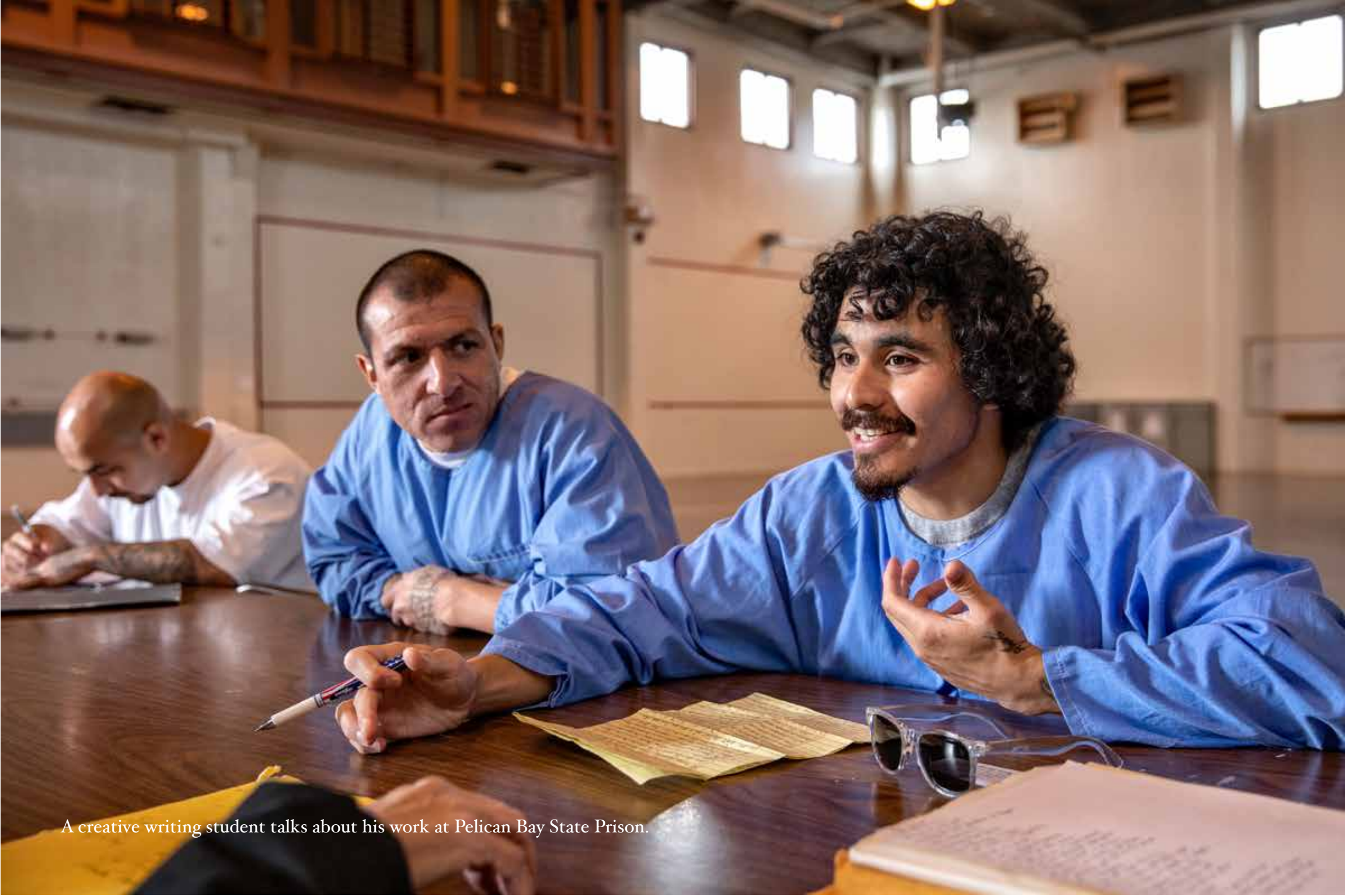
A creative writing student talks about his work at Pelican Bay State Prison.