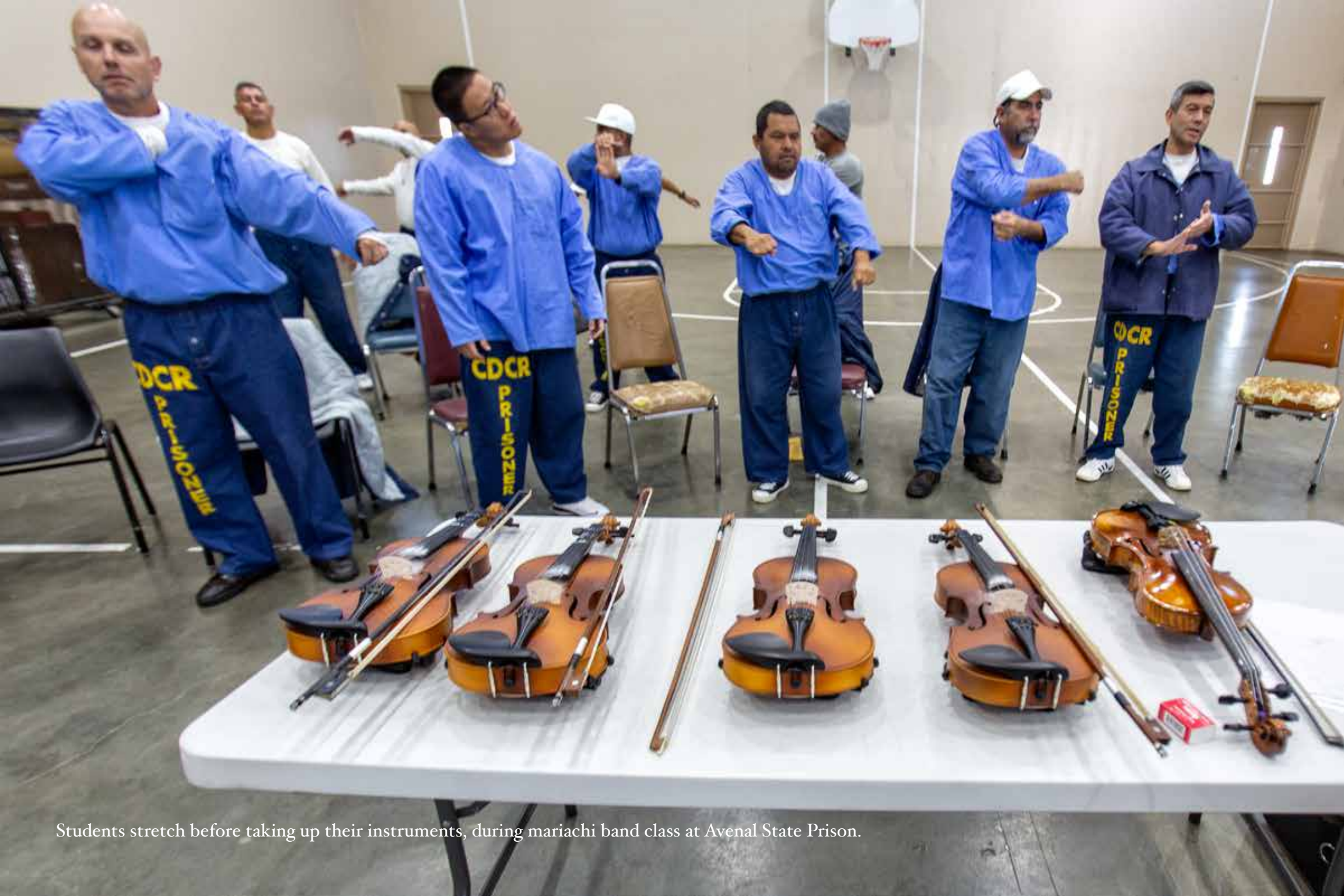
Students stretch before taking up their instruments, during mariachi band class at Avenal State Prison.