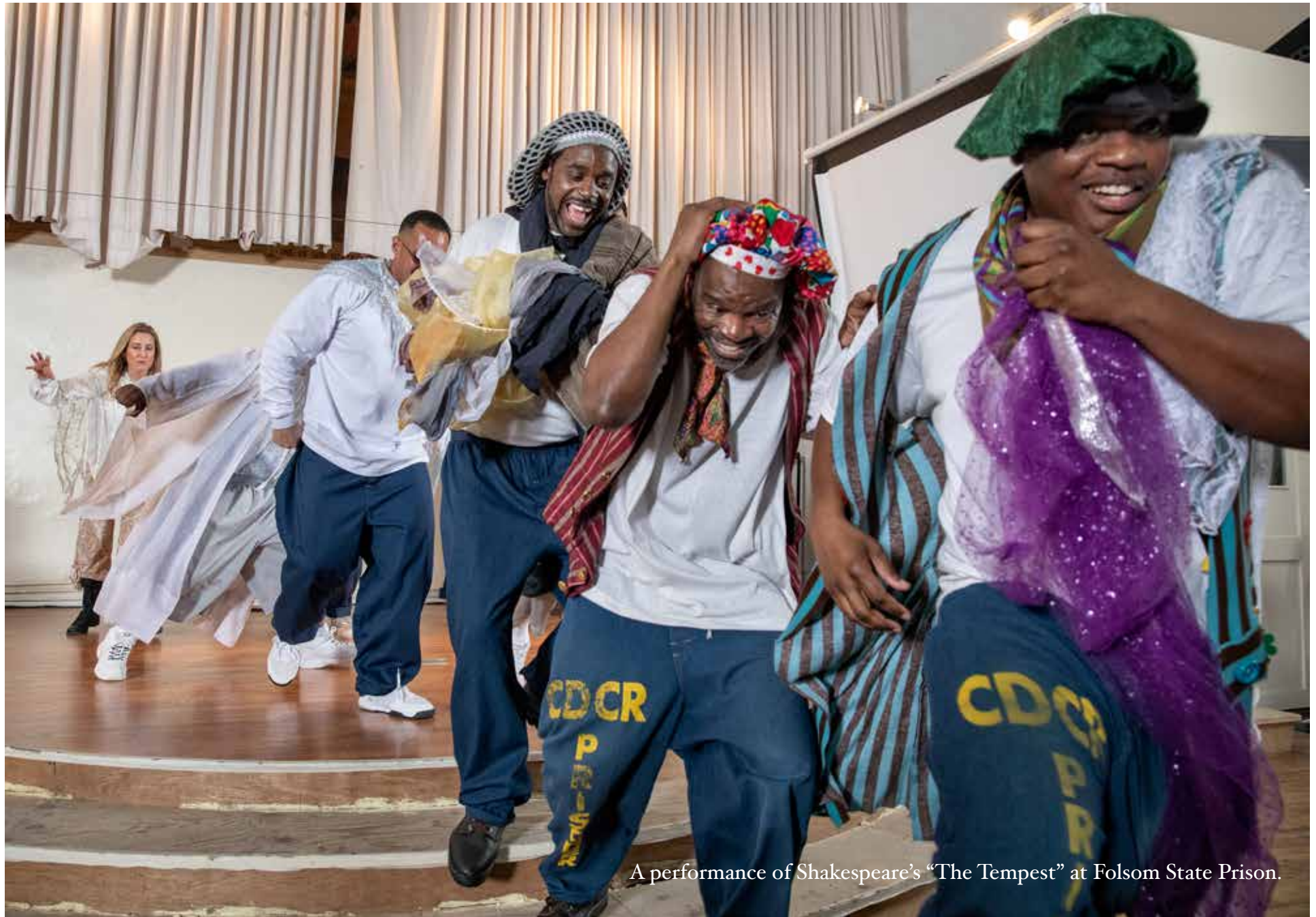
A performance of Shakespeare's "The Tempest" at Folsom State Prison.