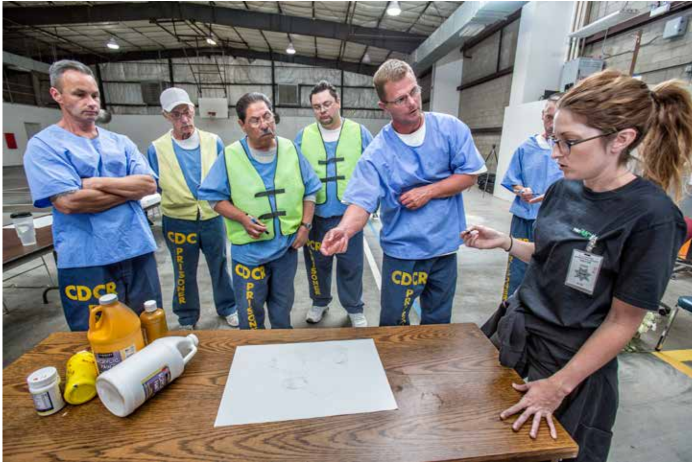
The instructor sets up a drawing exercise, in the gym at Donovan State Prison.