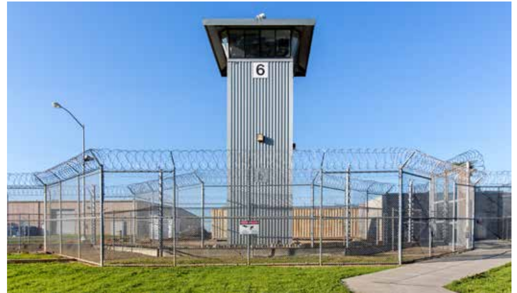
A gun tower at Solano State Prison. (above) Interior of North Block housing unit, at San Quentin State Prison. (below)