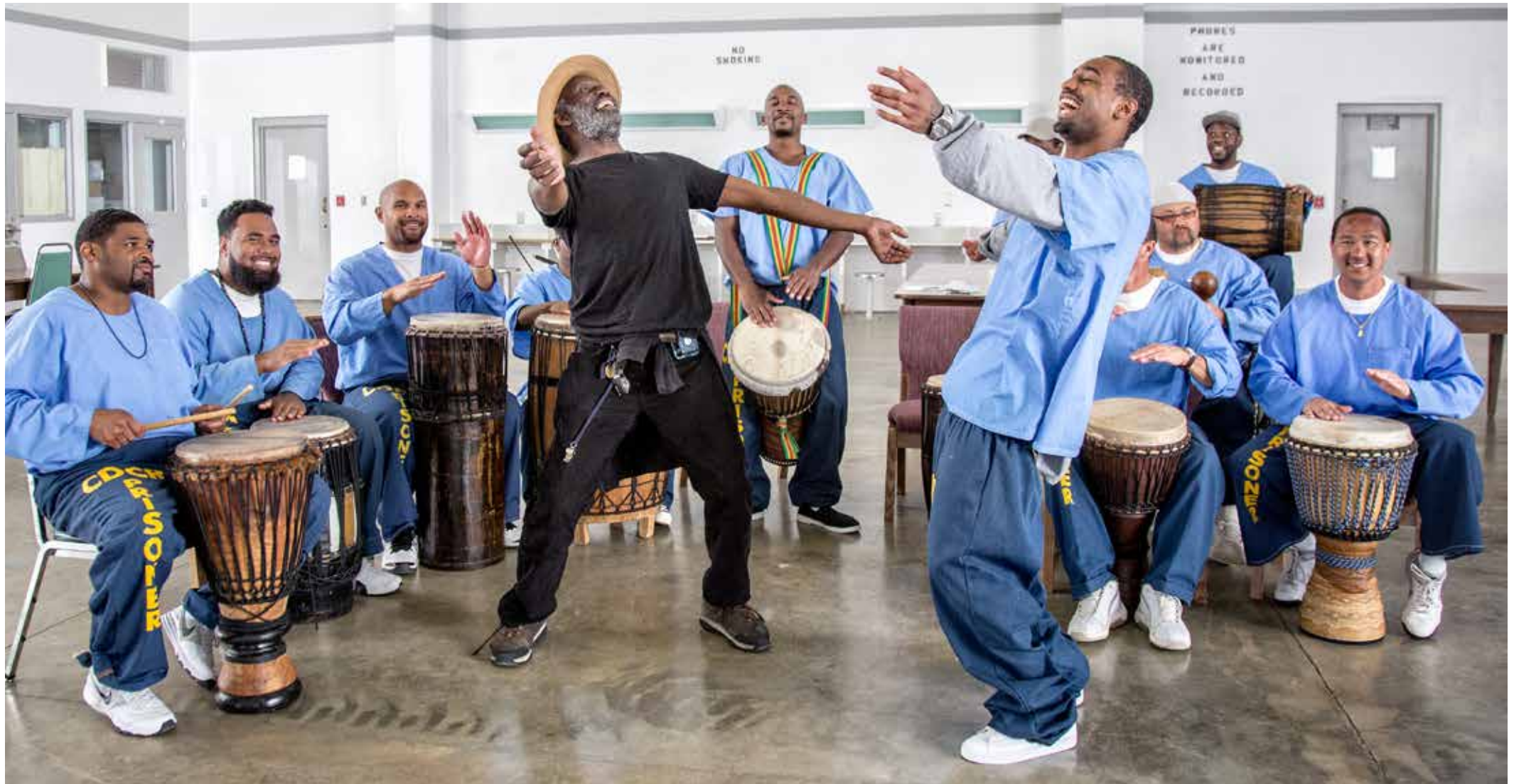
The instructor and a student dance during a drumming class, at Salinas Valley State Prison.

the nation have shown that art teaches prisoners how to work with focused discipline. It is through hard work that we learn the value and satisfaction of completing projects. The creative process often has the added satisfaction of having something to show for the effort—a poem, essay, novel, drawing, song, or performance (Brewster 2011, 2014).