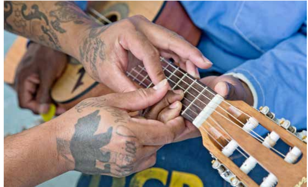
One guitar student helps another with finger placement, during class at High Desert State Prison.