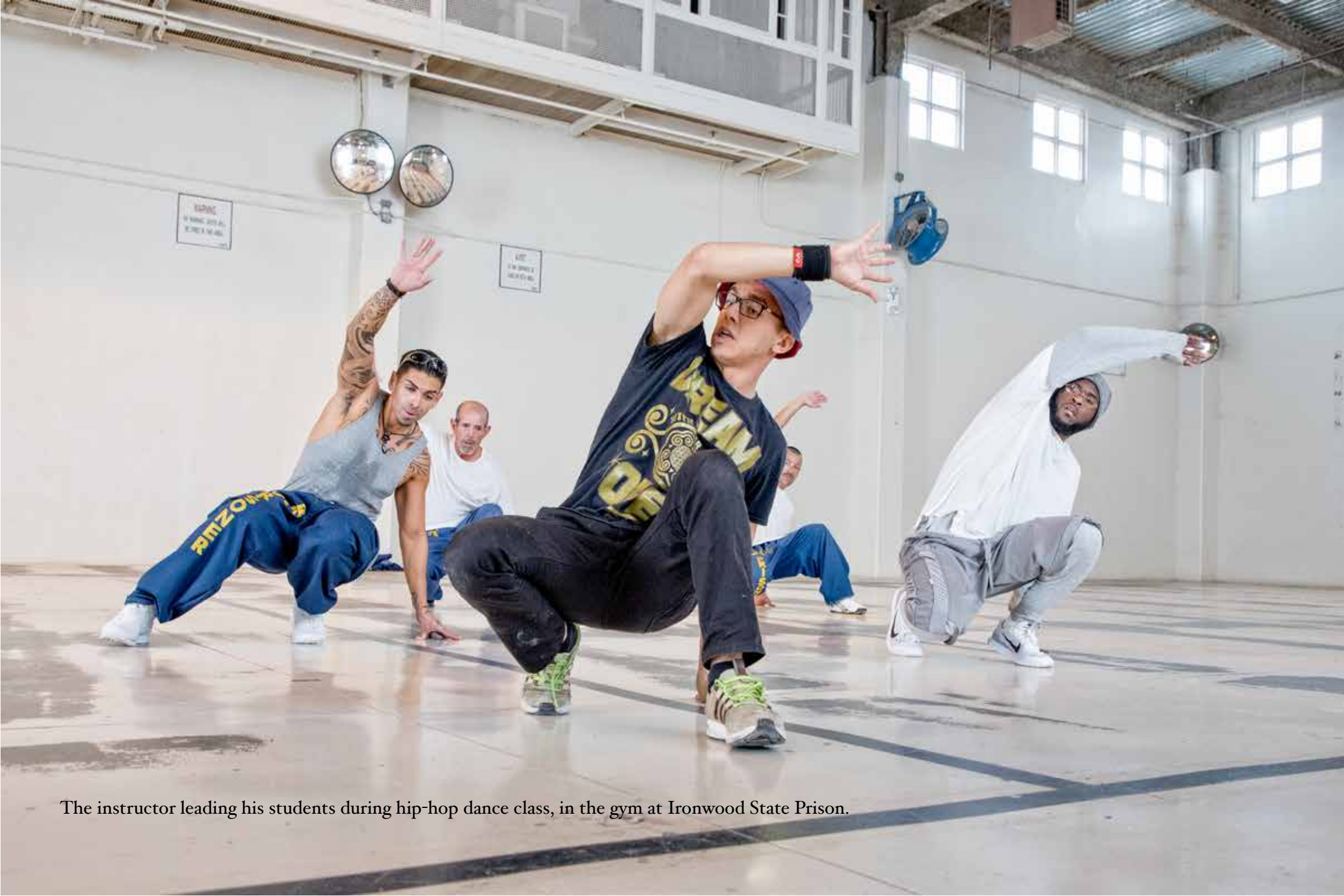
The instructor leading his students during hip-hop dance class, in the gym at Ironwood State Prison.