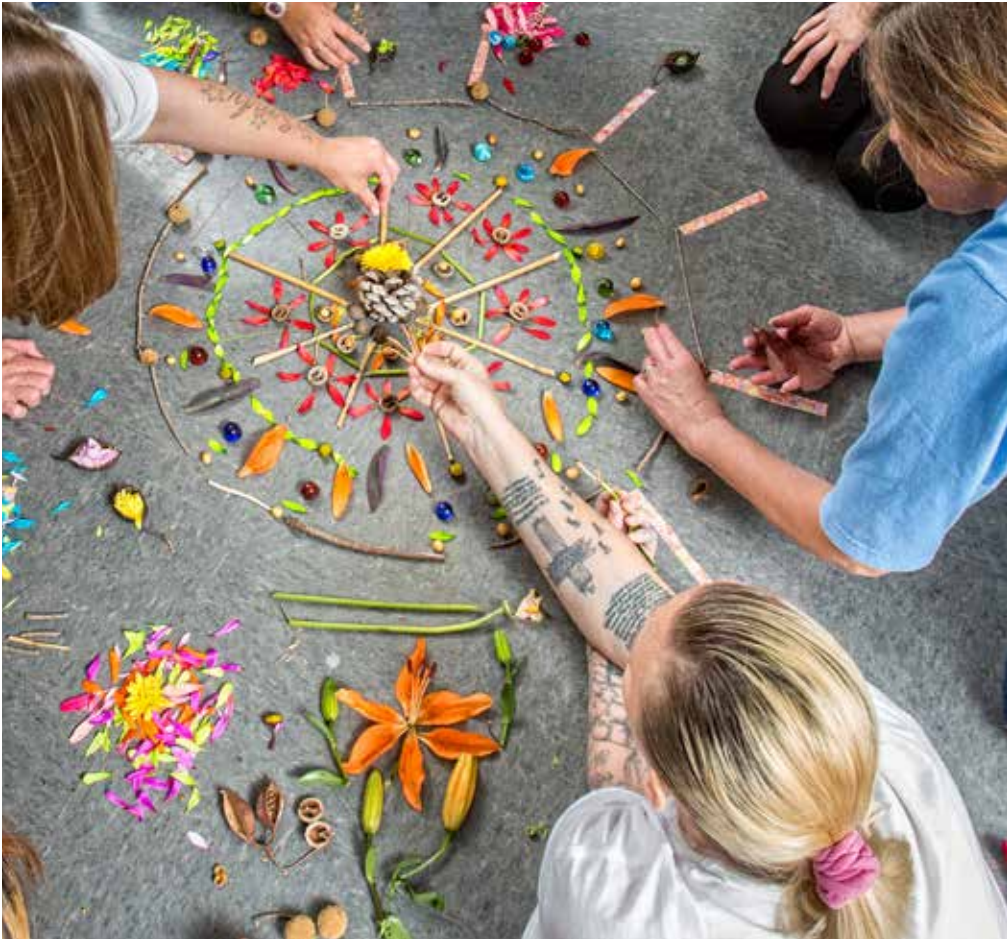
Creating a mandala with flower petals at California Institution for Women.