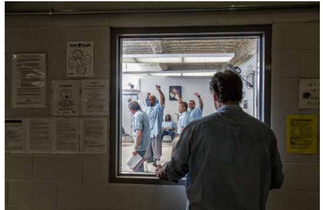
An actor awaits his cue during rehearsal of Shakespeare's Macbeth at Solano State Prison.