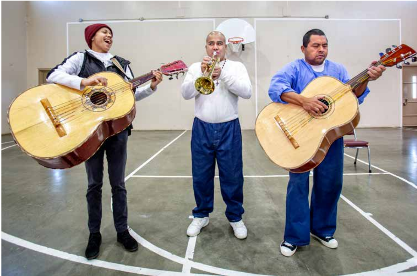
An instructor and two students, during mariachi band class at Avenal State Prison.