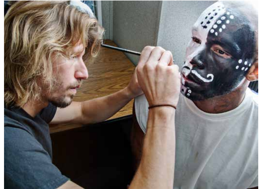
A theater class instructor helps a student with his makeup at Norco State Prison..

To the extent possible, AIC classes were run as if the setting were an art school, not a prison. Inmates in poetry class, for example, published anthologies and chapbooks. Musicians and actors put on productions for audiences at the institution. Painters submitted their works for consideration in juried contests and exhibitions. During AIC's forty years, several thousand inmates received tens of thousands of hours of art instruction from hundreds of artist-instructors. Other benefits were derived from institutional beautification and community service art projects, including murals at many state prisons and annual fundraisers in support of children with incarcerated parents.