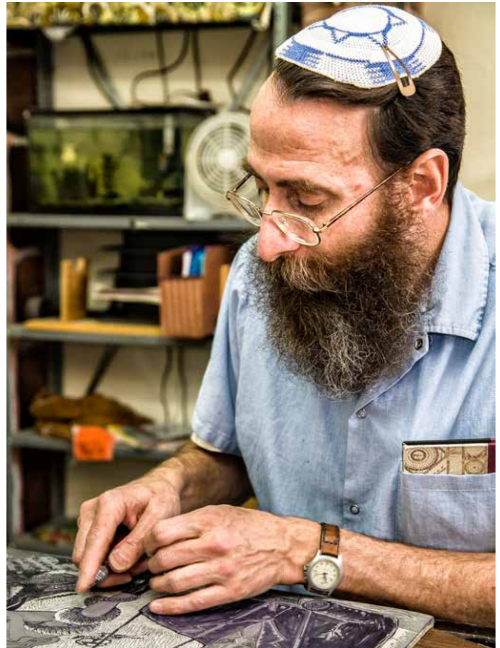
Printmaking student carving linoleum at San Quentin State Prison.

Blacker, et al (2008) report one of the most encouraging findings that suggests the artistic process provides a safe and acceptable way to express, release, and deal with potentially destructive feelings such as anger and aggression. Perhaps it is for this reason that prison arts programs positively impact prisoner behavior. A study of inmates participating in arts programming in England showed, for example, a twenty-nine percent reduction in disciplinary incidents compared to their prior records. Staff reported improvements in prisoners' attitudes toward work, including an increased ability to occupy themselves in their cells. Similar reductions in inmate disciplinary reports were found in a 1983 cost-benefit study of California's Arts-in-Corrections program (Brewster).