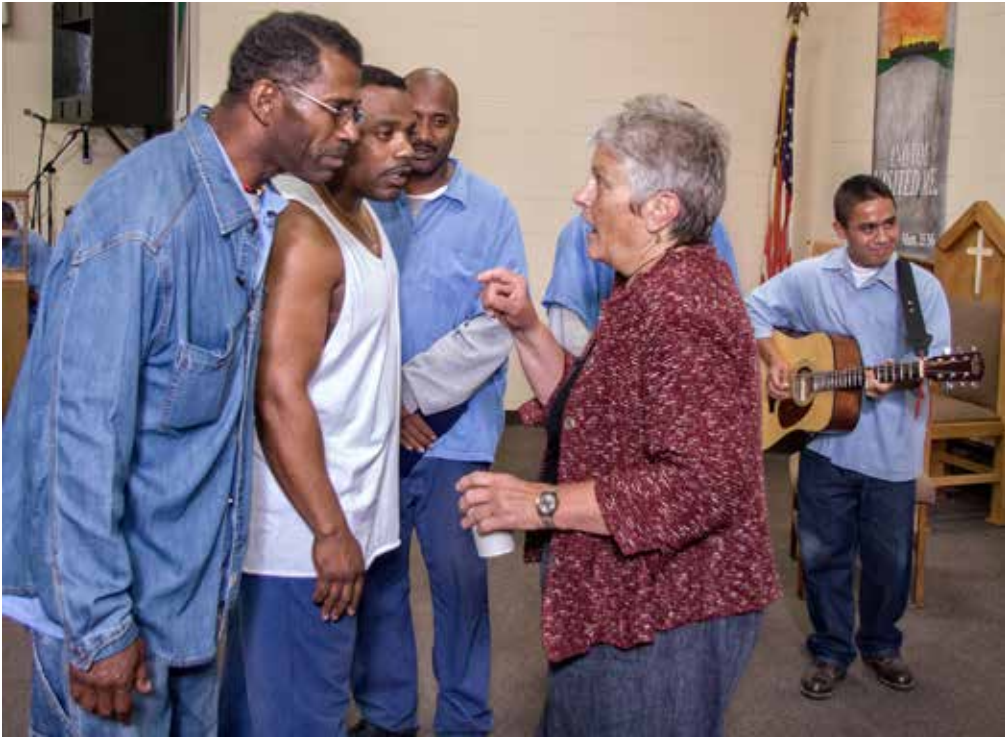
A vocal improvisation workshop, in the Protestant chapel at San Quentin State Prison.

time, others to learn a new hobby. Still others have turned to the easel, the written word, music, or the kiln with visions of success in the commercial art world. Nearly everyone discovers an identity other than their prison number, experiences greater confidence, self-awareness, and intellectual agility and a heightened motivation to pursue additional educational and vocational programs.