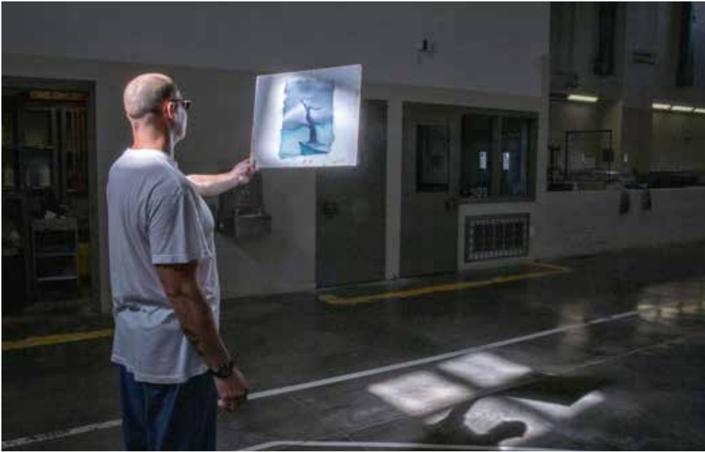
A student stops to inspect his painting in window light at Pleasant Valley State Prison.