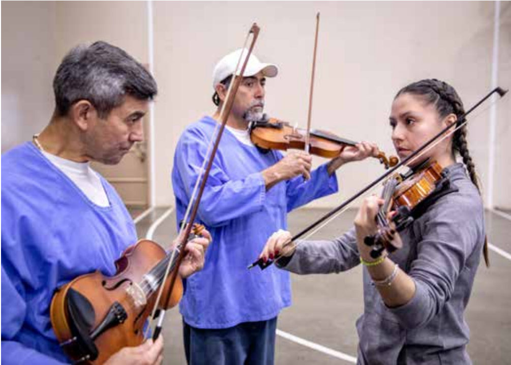
A mariachi band instructor demonstrates technique, at Avenal State Prison.

and evaluating artist-instructors, enrolling and monitoring inmate-artists, scheduling classes, purchasing art supplies, and navigating the prison bureaucracy with its complex and ever-changing rules, regulations, personnel, and politics.