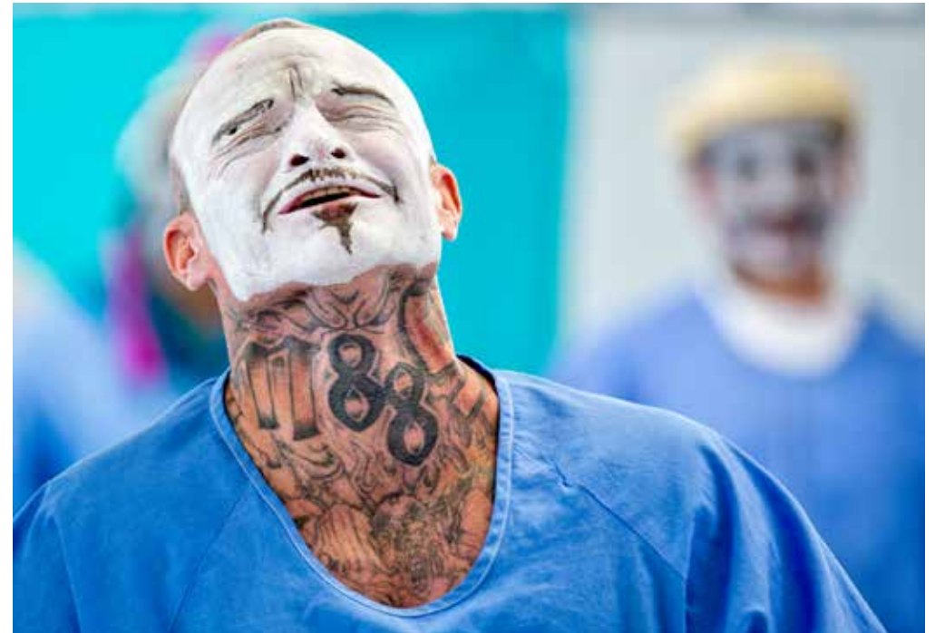
A theater student emotes during class at Ironwood State Prison.

Evaluations of prison arts programs consistently show that significant, positive, and persistent life changes happen for the vast majority of men and women who participate. The various fine arts classes offer prisoners the opportunity to "do their time with purpose and focused attention to their art," and to better prepare for productive lives post-incarceration. Prison arts programs in this country and abroad consistently demonstrate the power of the artist in each of us, and remind us that we should not, cannot give up on people—regardless of their past mistakes.