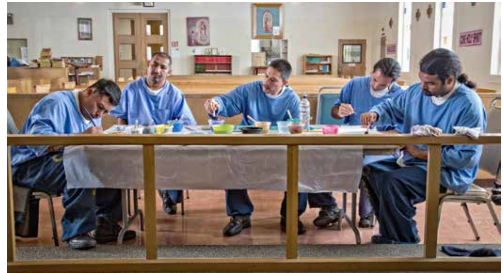
Painting students in the Catholic chapel at Sierra Conservation Center.

Prior to starting any course, the teaching artist must work with the prison security staff to arrive at a list of approved materials and tools. Solvents, some adhesives, and metal tools are prohibited in many California prisons; where allowed they are carefully inventoried before and after each class. Some teachers are fortunate enough to have onsite lockers for storing materials between classes—otherwise, every paintbrush, eraser, pencil,