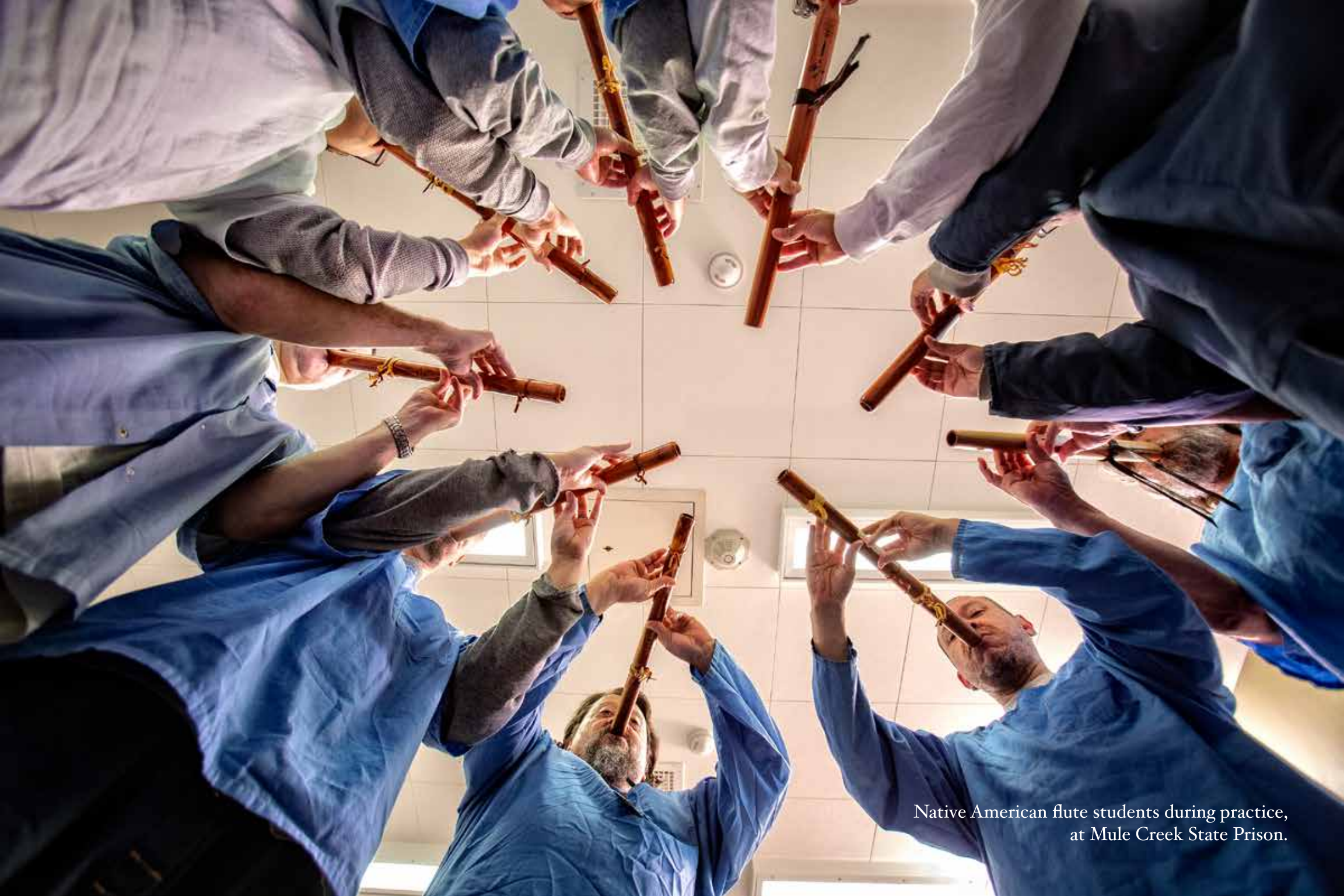
Native American flute students during practice, at Mule Creek State Prison.