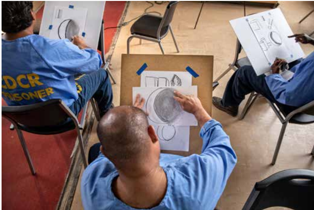
Drawing students work on a class assignment at High Desert State Prison.

those teaching artists, and her belief that those programs and instructors were responsible for saving her son's life. He came to understand through his writing and music that his prior belief in his own invincibility was an empty posture. "Music" she said, "ignited a talent for classical guitar and song writing that he never knew he had. Creative writing has been an enormous therapeutic tool allowing him to connect to personal issues that he otherwise would not be willing to address".