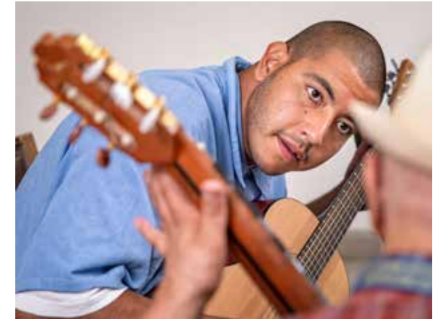
A guitar student watches his instructor at North Kern State Prison.