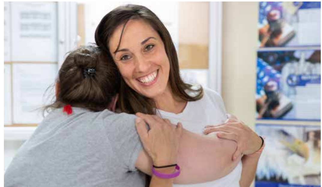
Two students embrace during a theater class at Folsom Women's Facility.