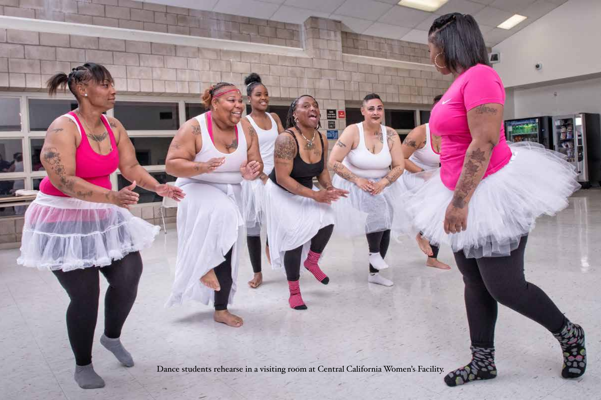
Dance students rehearse in a visiting room at Central California Women's Facility.