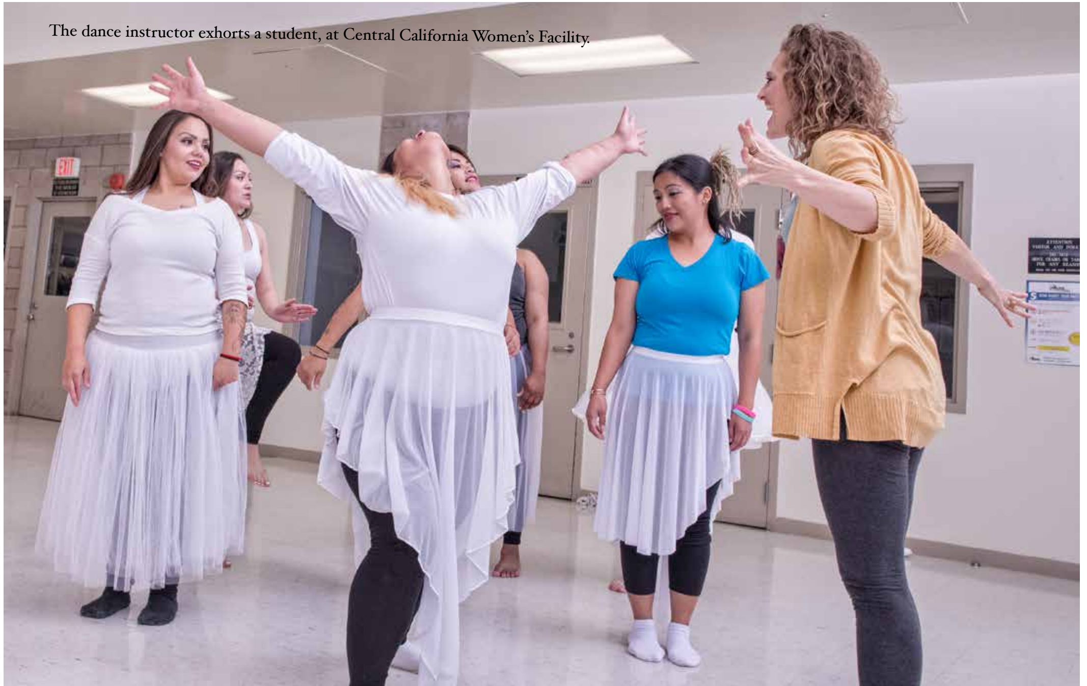
The dance instructor exhorts a student, at Central California Women's Facility.