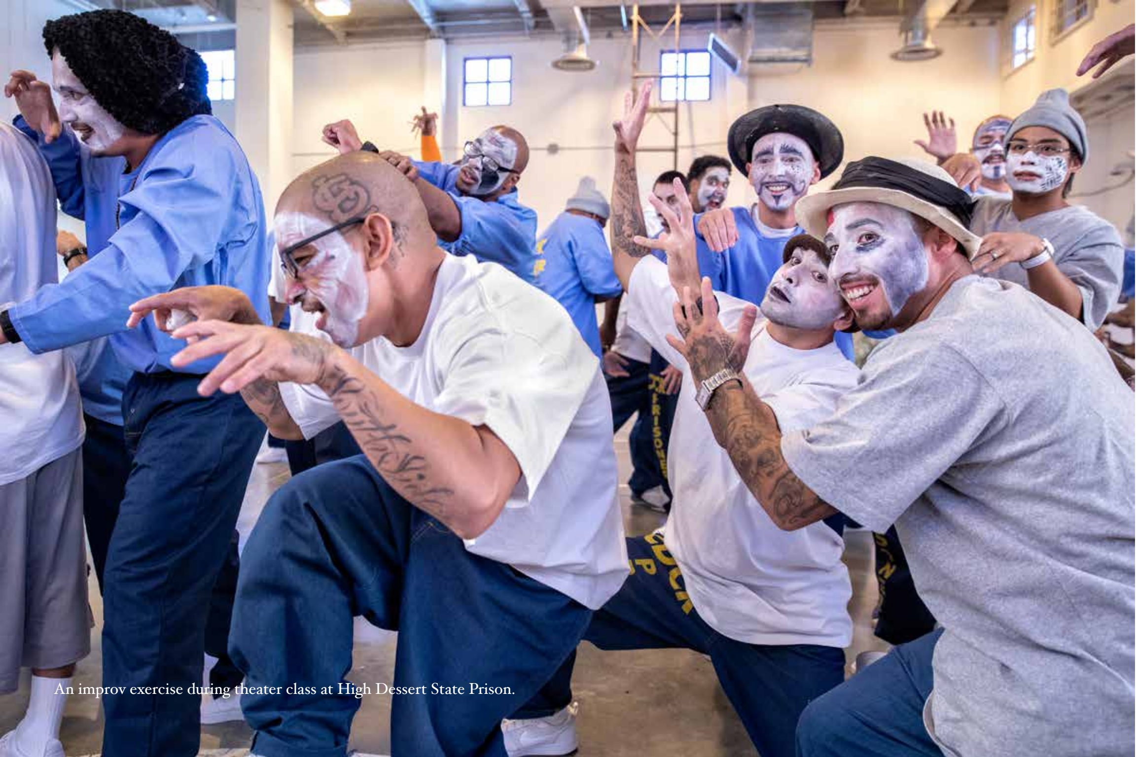
An improv exercise during theater class at High Desert State Prison.