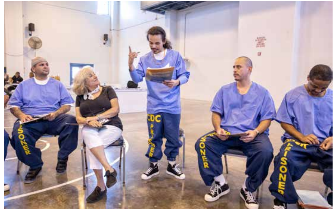
A creative writing student reads his work to the class at Kern Valley State Prison.