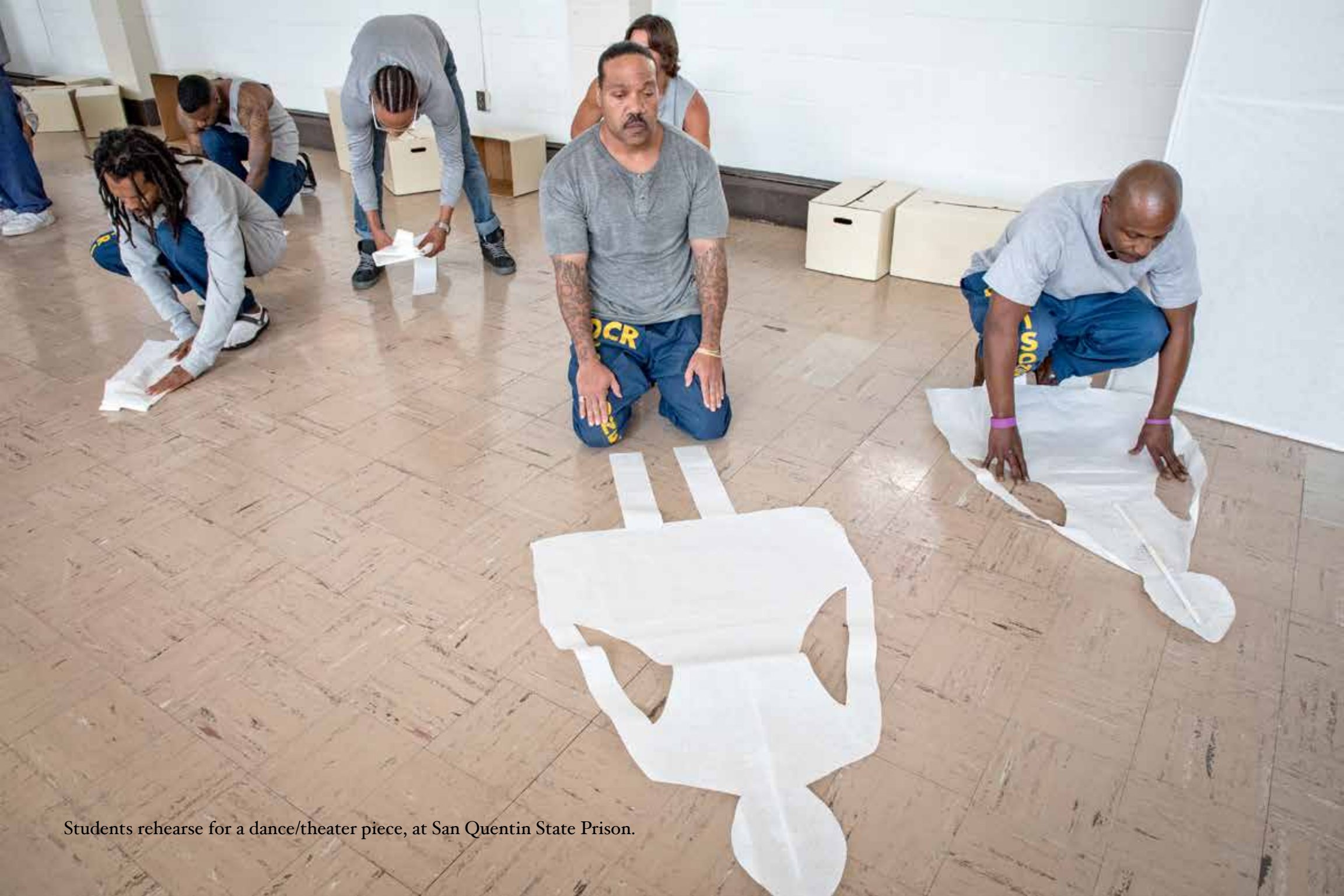
Students rehearse for a dance/theater piece, at San Quentin State Prison.