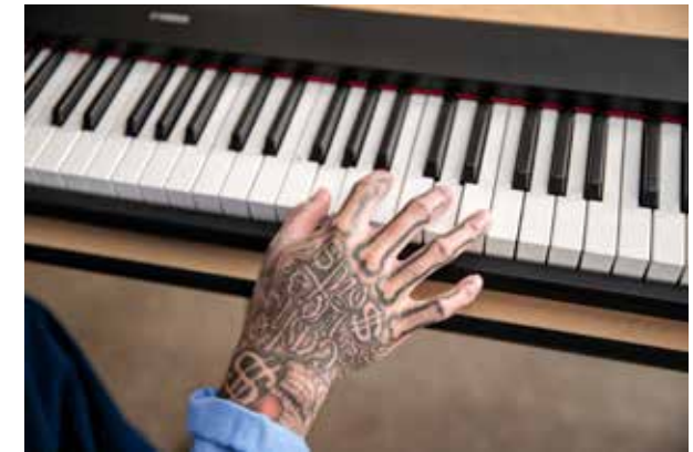
The hand of a music student at CCI Tehachapi.

could raise his or her self-esteem, and thus improve behavior by replacing their curtailed corporal freedom with an inner freedom gained through the discipline and rewards of art. She proposed a curriculum in the visual, literary and performing arts which would “provide an opportunity where a [person] can gain the satisfaction of creation rather than destruction.”