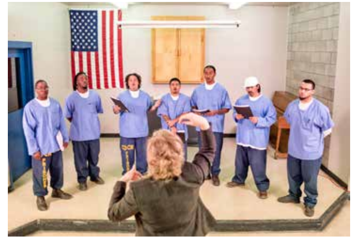
The choral music class rehearses in a small chapel, at California Correctional Center.

theater, or any number of other artistic, creative pursuits—often find their unknown selves and come to understand and take responsibility for their past and future behavior. In the process, they find fellowship with other artists—regardless of race, ethnicity, gang affiliation, or crime—in what is an otherwise cold, dangerous, overcrowded, and isolating environment.