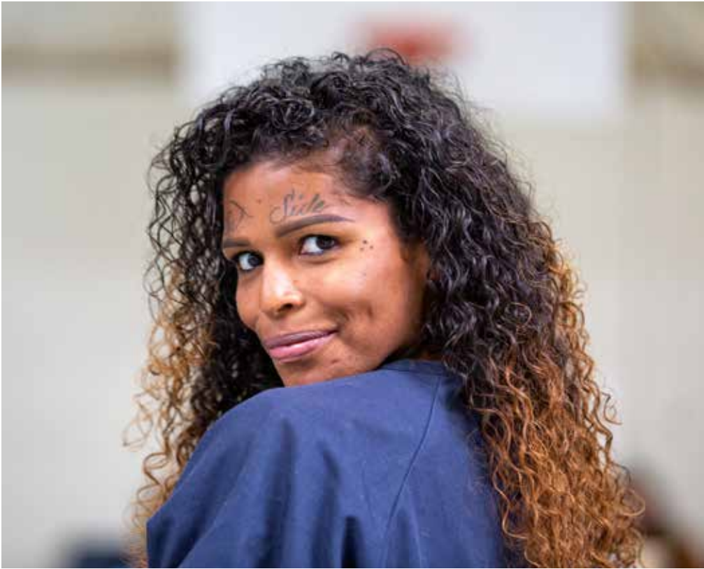
A theatrical student at Donovan State Prison.

successful run from 1980 to 2010, when the California State Department of Corrections and Rehabilitation (CDCR) eliminated the program during the state budget crisis resulting from the Great Recession. Then for several years the program was largely dormant; it persisted only at a few prisons such as San Quentin, in very limited fashion, thanks to heroic but scattered fundraising efforts and a handful of artist-instructors who continued to teach without pay, rather than abandon their students. In recent years, California Arts-in-Corrections has been resurrected; as of 2019, all 36 of the state's adult correctional facilities—33 for men and three for women—have AIC classes with an annual budget of eight million dollars.