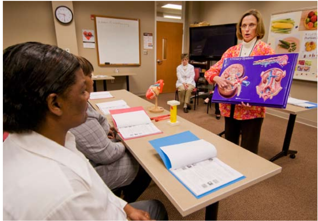
A program for diabetics.

One of the Center's most beneficial programs is the Prescription Assistance Program. This program employs a patient advocate to help individuals and families select the best prescription plan available to them. In addition to the Prescription Assistance Program, the Center created an Emergency Medicine Program for the uninsured and those with inadequate drug coverage. The Delta-AHEC spends approximately $60,000 a year helping individuals pay for prescription drugs.