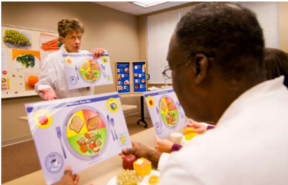
Nutrition and diet are often discussed at the center.