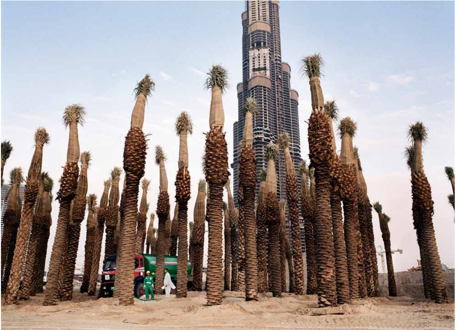
The Burj Dubai building. It will become the highest building in the World, over 800 meters high.