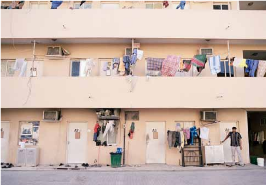
Workers live in housing that is over-crowded and squalid.