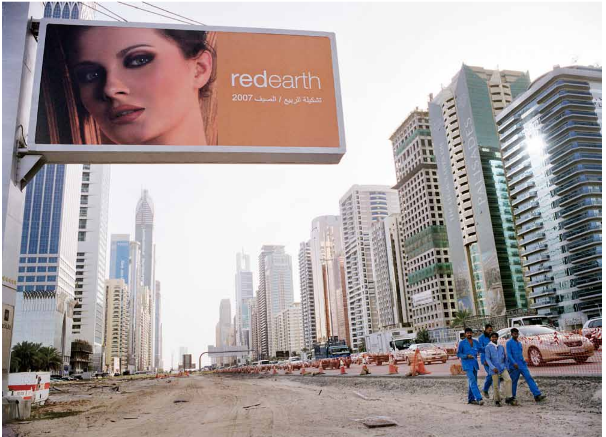
Sheik Zayed Road is the main traffic thoroughfare through new Dubai. Workers are expanding it to ten lanes.