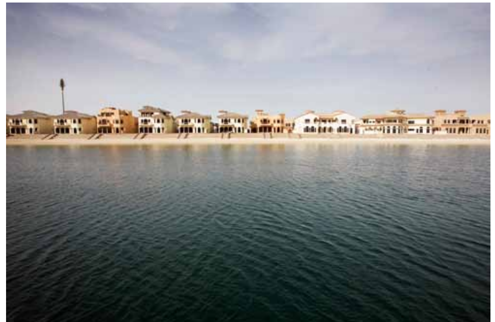
The community of Palm Jumeirah.