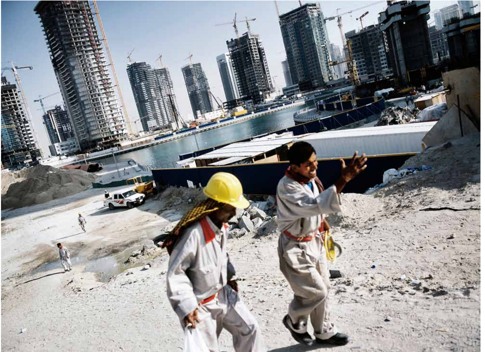
Workers leave the construction site at day's end.