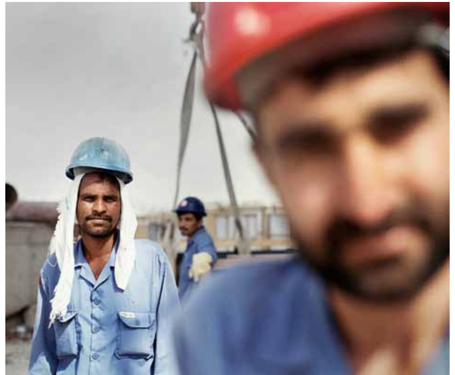
There are over 50,000 millionaires among 200,000 locals. The average income of a construction worker is $180 a month.

Ninety percent of Dubai's 1.6 million residents are foreigners, some of whom are businessmen, playboys, or those who have immigrated out of a sense of adventure. The majority, however, are poorly-paid foreign laborers. In a few decades, Dubai has transformed into an Arab "world city." It produces neither large quantities of oil nor terrorists; rather it sells dreams. In addition to a shopping mall with a ski slope, Dubai has five-star hotels like the Burj-al-Arab, built in the shape of a solar sail, and a group of islands, recognizable— from space - as a map of the world.