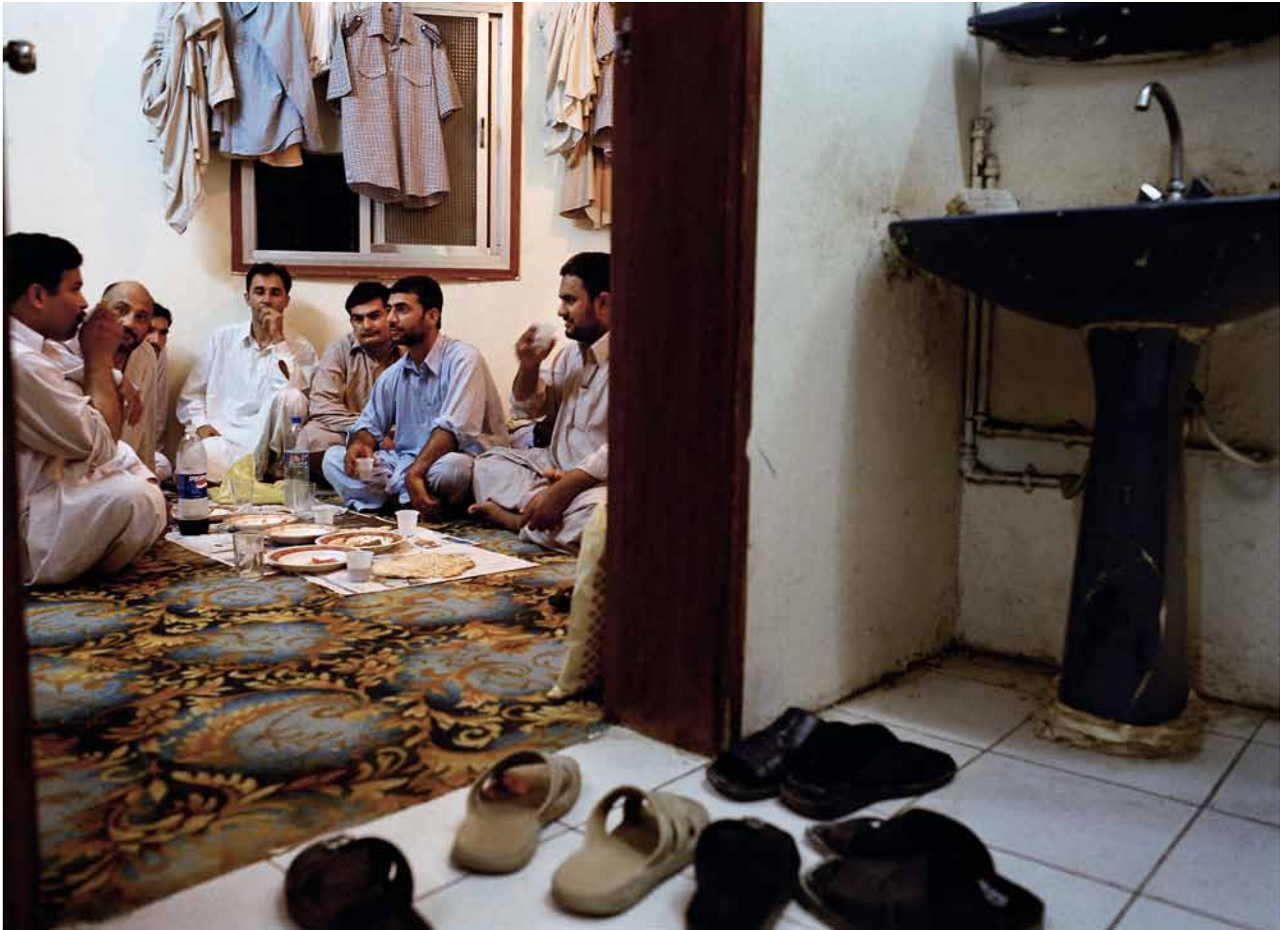
These Pakistani men sit down for a dinner after a day on construction site. Twelve people share this one small apartment.