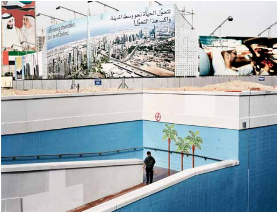
The city is covered with advertising which is pure irony in relationship to the workers lives.