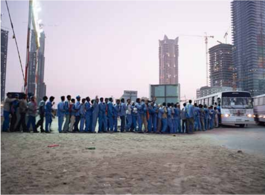
Men leave the construction site and are bused to housing built specifically for them.

to Dubai. After a physical examination, he got his visa and a plane ticket, which he has paid off in installments over the last three years.