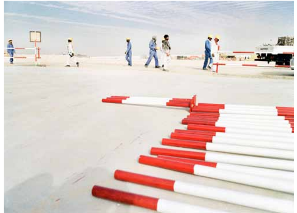
Dubai is dominated by the colors red and white.

Not far from Palm Island is the Dubai Marina, a “marina of superlatives.” There, for a change, one will find no foreign laborers. This is a place of conspicuous consumption. The windshields of the cars are tinted, as if those inside are important. Emirates with flowing caftans and waving scarves stroll across the boardwalks, children play in the fountains, and tourists eat in outrageously expensive restaurants or smoke hookahs. The Sheesha sits in the body of the hookah pipe, connected to the guests by hoses that sprout from it as if it were a beast with many heads. This beast blubbers and gurgles like a clogged drain. “Such is Dubai: Decadent and unhurried,” says Ali, a local who works in city administration. The citizens are known for not doing labor; most of them work as civil servants or in state enterprises. They represent power, while Kaleem from India or the ironworker with the shark teeth on Palm Island represent impotence.