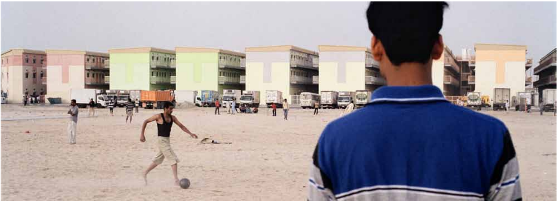
On their day off, the men play a game of soccer in front of the housing units built specifically for immigrant workers.