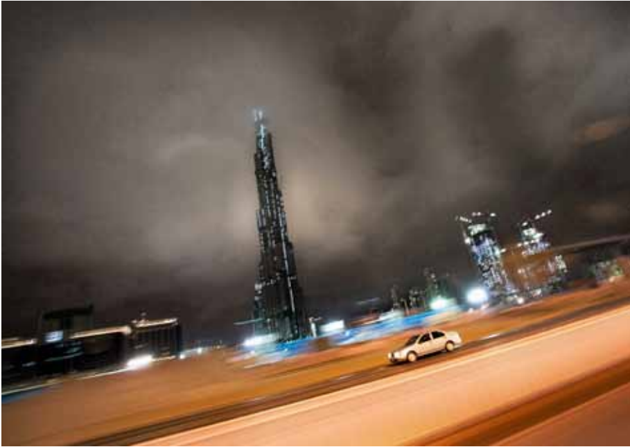
Burj Dubai at night, driving on Sheik Zayed Road.

At a cost of over $1.8 billion U.S., the Burj has been more expensive than the citizens of Dubai expected. Two thousand and four hundred foreign workers labor here daily in two shifts. The fifty-four double-decker elevators will travel fifty-nine feet per second and the cooling system will give off more cold air than 9,000 metric tons of melting ice per day. The one-hundred and sixty stairways are fireproofed, which after 9/11 has proven necessary. One-thousand palm trees with fluttering crowns will soon be planted around the building. Everything has a Tower of Babel quality to it.