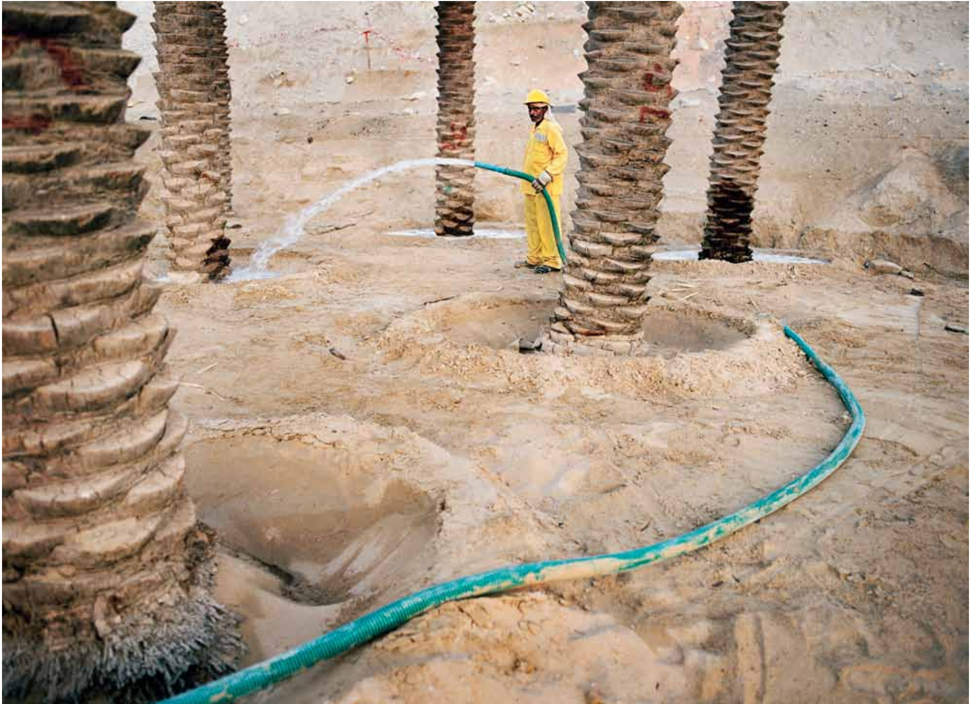
This man waters the imported palm trees in front of Burj Dubai construction site. He does it every day all year long.