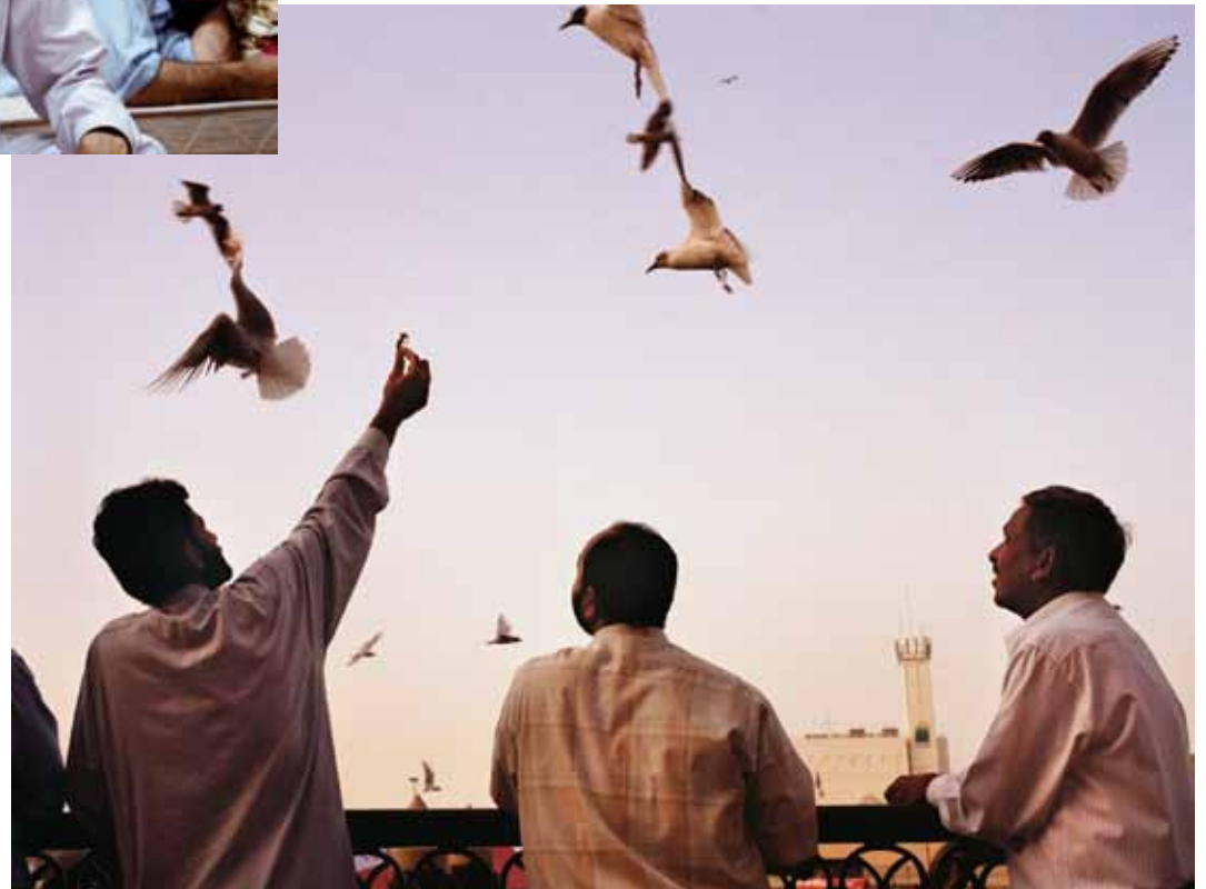
Most of the men feel like aliens in this city. They call Dubai the city without soul.