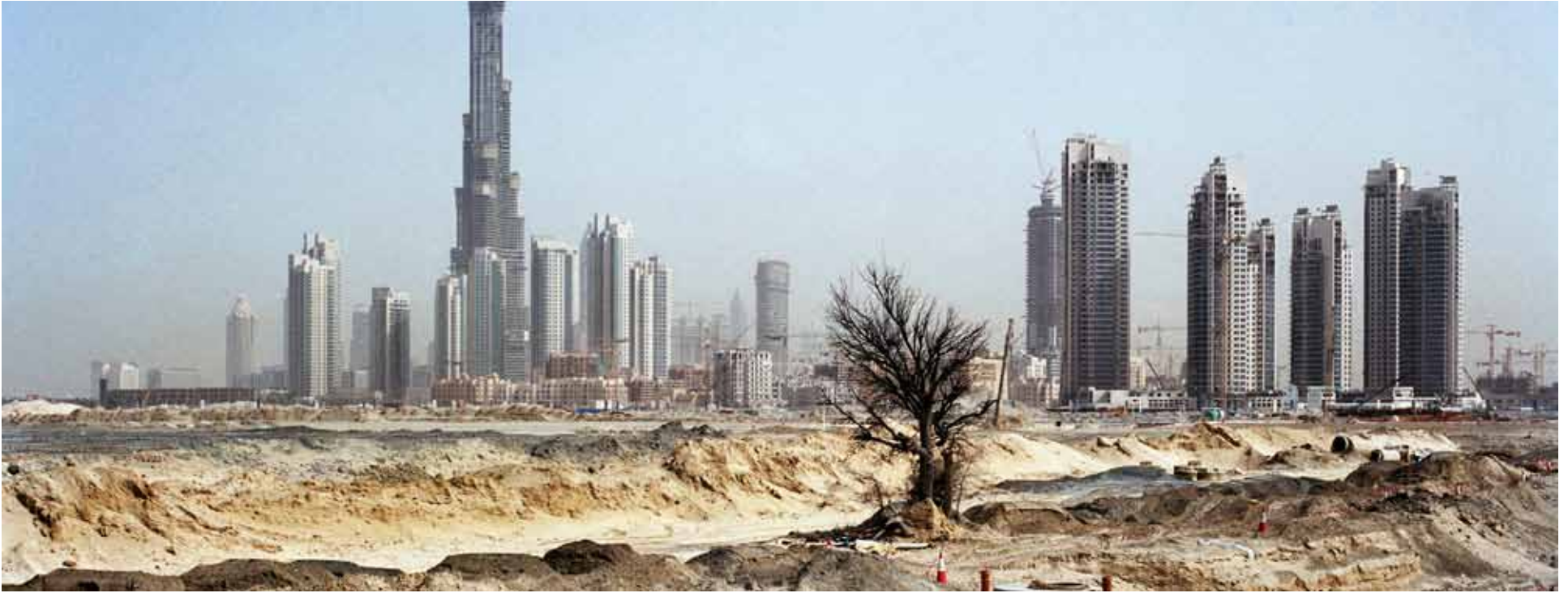
Dubai's downtown area rises out of the desert.

The break is over and it's back to the top story for Kaleem. "I'm proud to take part in the construction of the biggest house in the world," he says. After its completion this year, the Burj Dubai will measure well over 3,280 feet in height. The building's owners are keeping the exact height a secret. The building site is cluttered with the swinging arms of cranes, which move through the air like tentacles and swing their loads past the wispy clouds hanging in the surrounding sky. One out of every six cranes in the world is in Dubai.