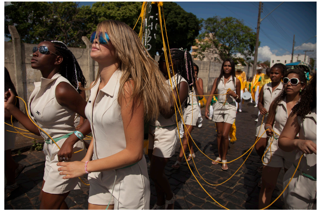
On April 19, throughout Brazil, many black cultural groups celebrate the feast of São Benedito (Saint Benedictus), who is the black saint of Brazil.