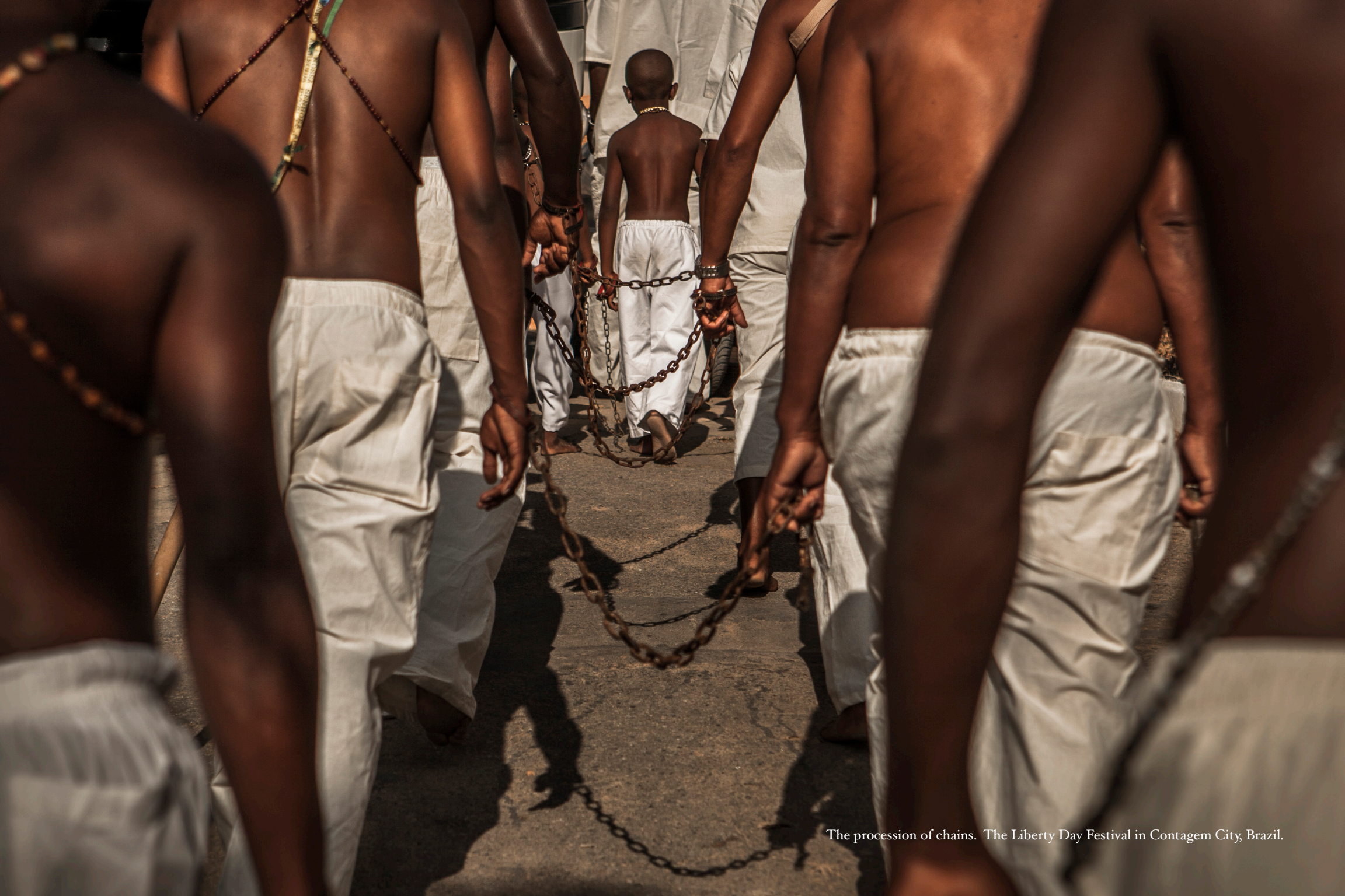
The procession of chains. The Liberty Day Festival in Contagem City, Brazil.