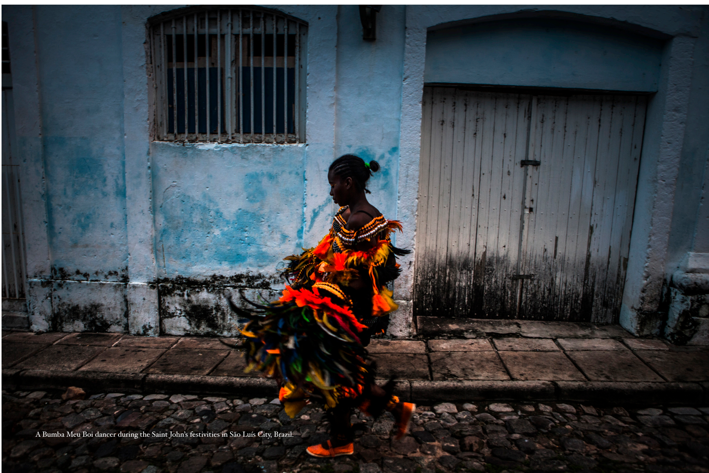
A Bumba Meu Boi dancer during the Saint John's festivities in São Luís City, Brazil.