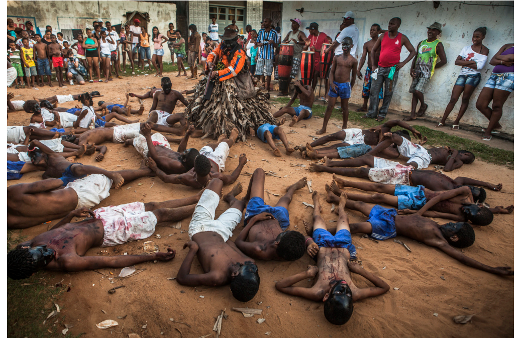
A Neco Fugido ceremony re-enacts the hunting and murder of runaway slaves.

These festivities are a testament in which one witnesses the recapitulation of the whole of a collective life. The black person from the plantations and the mines, and the domestic worker in the cities and in the slums set out to show their direct connection to the history of their people. The festival symbolizes a synthesis of conscious ancestry, folklore, and historical facts.