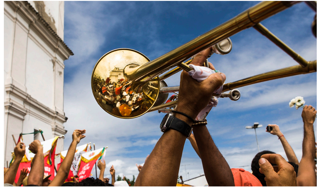
The Festa do Bonfim (Feast of Bonfim) is one of the most important popular Candomblé celebrations. It takes place in Salvador, Brazil.