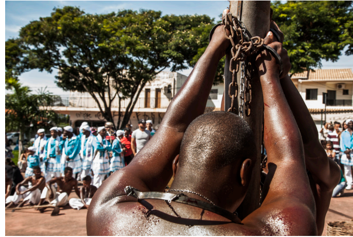
The black community of Arturos in Contagem City, Minas Gerais State, re-enacts slave punishments on Liberty Day.