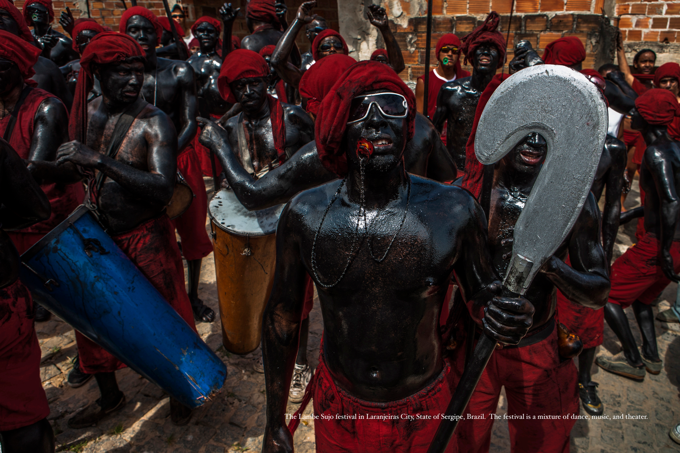
The Lambe Sujo festival in Laranjeiras City, State of Sergipe, Brazil. The festival is a mixture of dance, music, and theater.