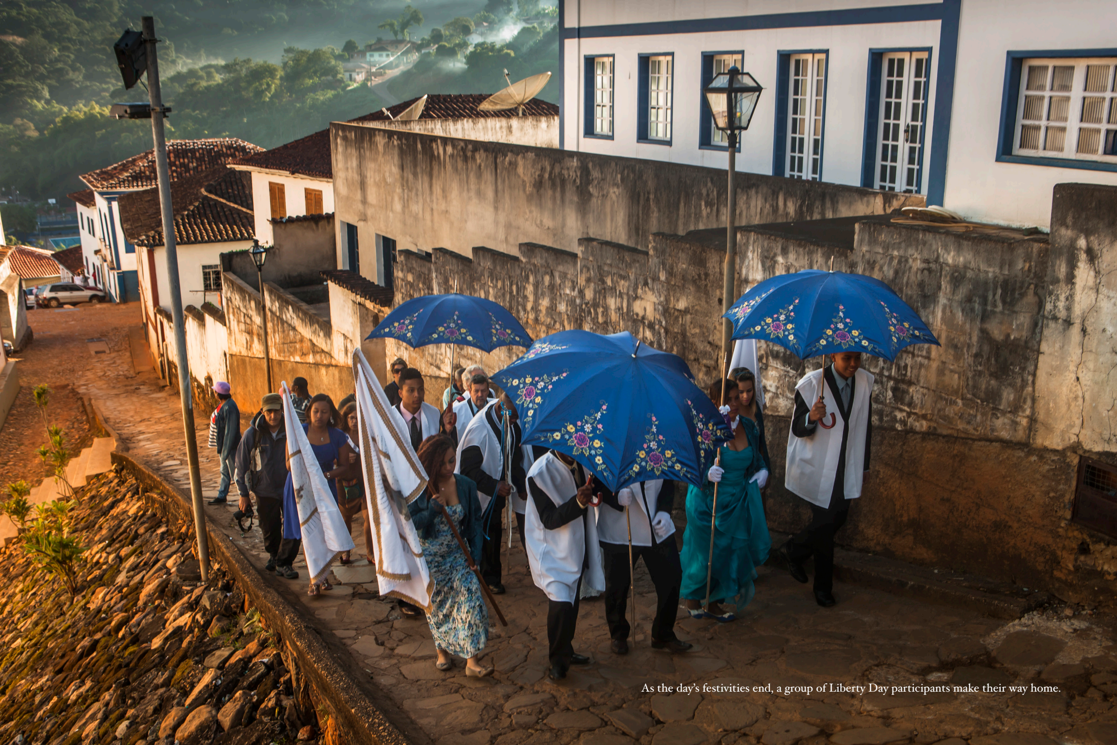
As the day's festivities end, a group of Liberty Day participants make their way home.