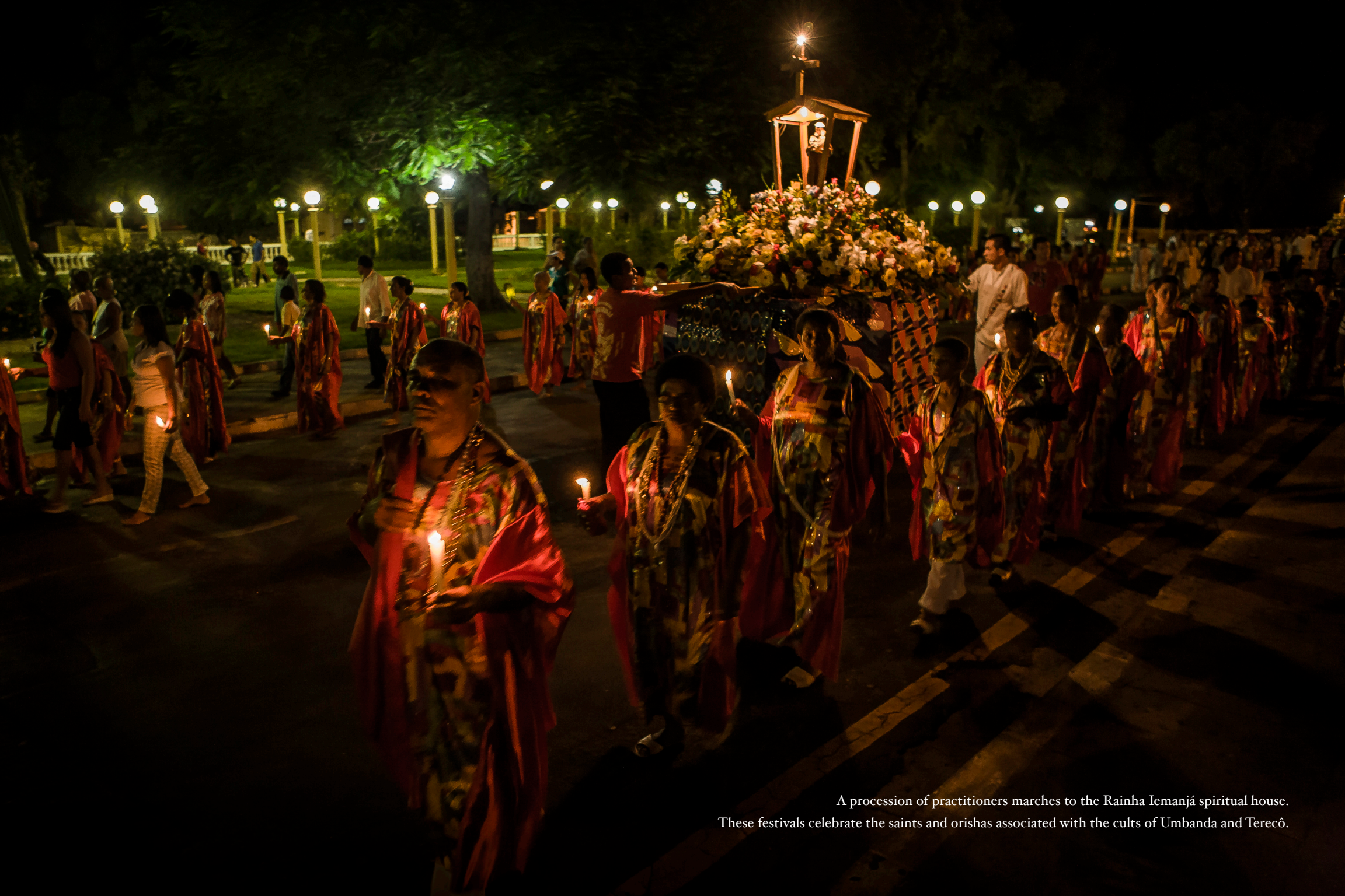
A procession of practitioners marches to the Rainha Iemanjá spiritual house. These festivals celebrate the saints and orishas associated with the cults of Umbanda and Terecô.