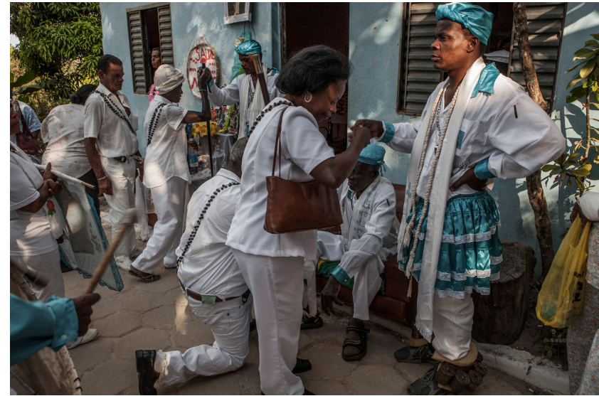
A woman receives a blessing during the Liberty Day festivities.