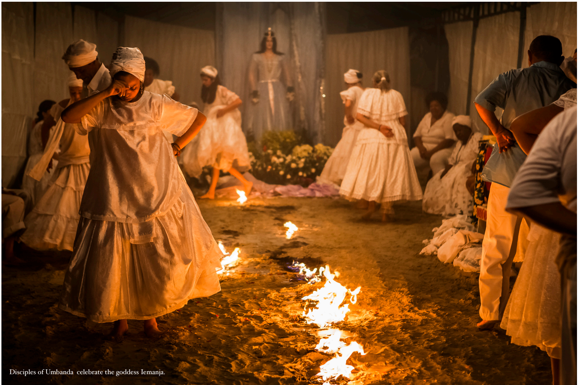
Disciples of Umbanda celebrate the goddess Iemanjá.