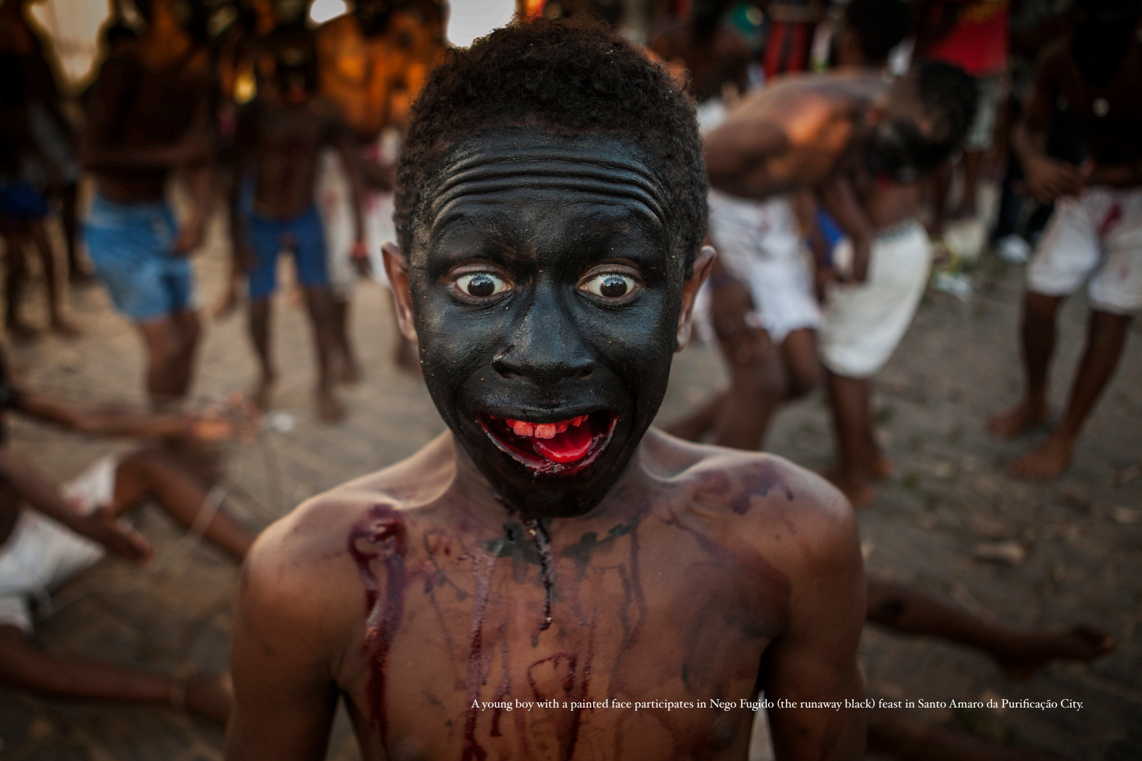
A young boy with a painted face participates in Nego Fugido (the runaway black) feast in Santo Amaro da Purificação City.