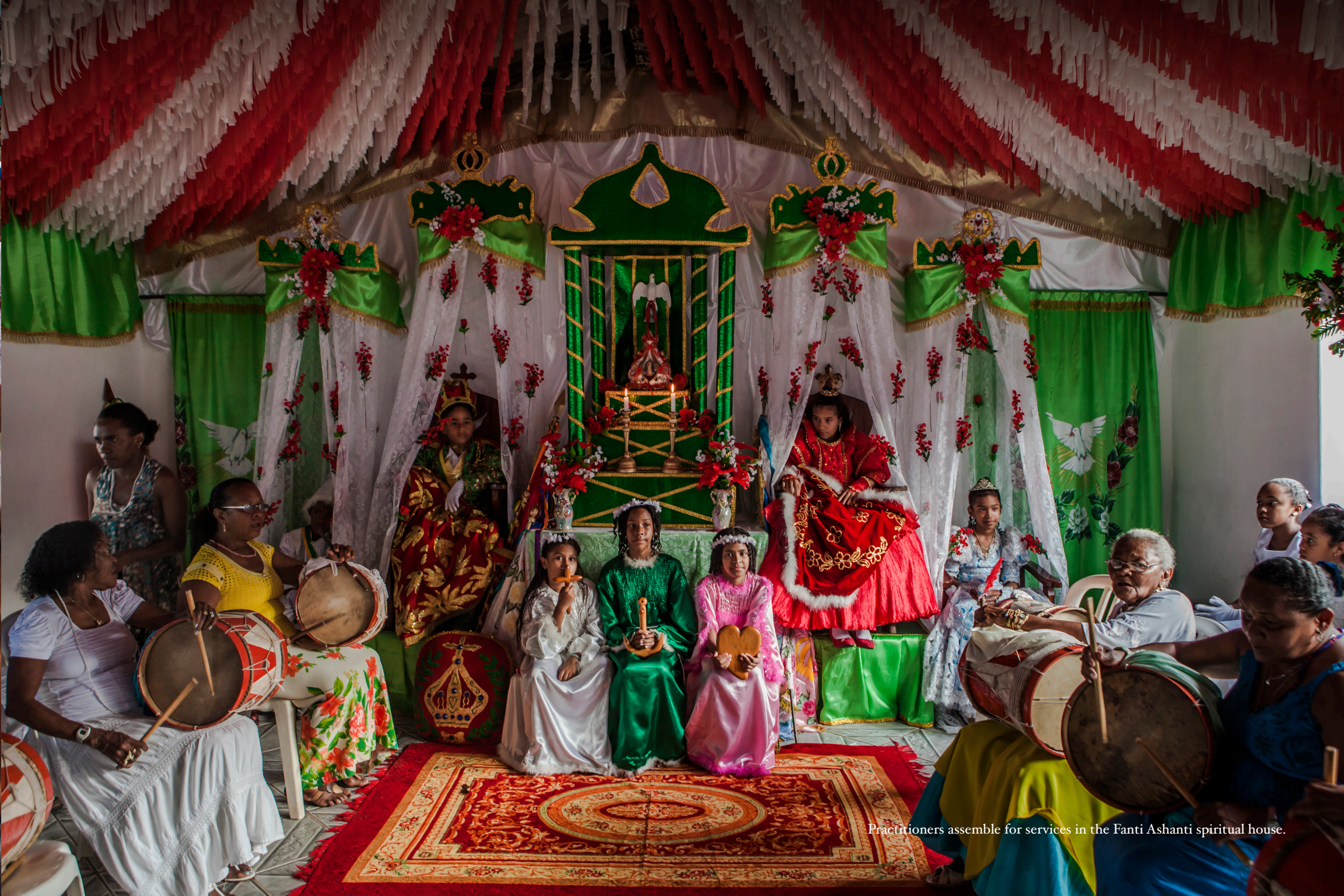
Practitioners assemble for services in the Fanti Ashanti spiritual house.