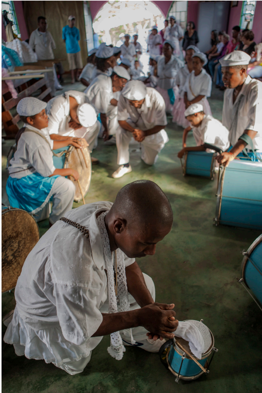
A young man puts down his drum to pray during the Liberty Day festivities.