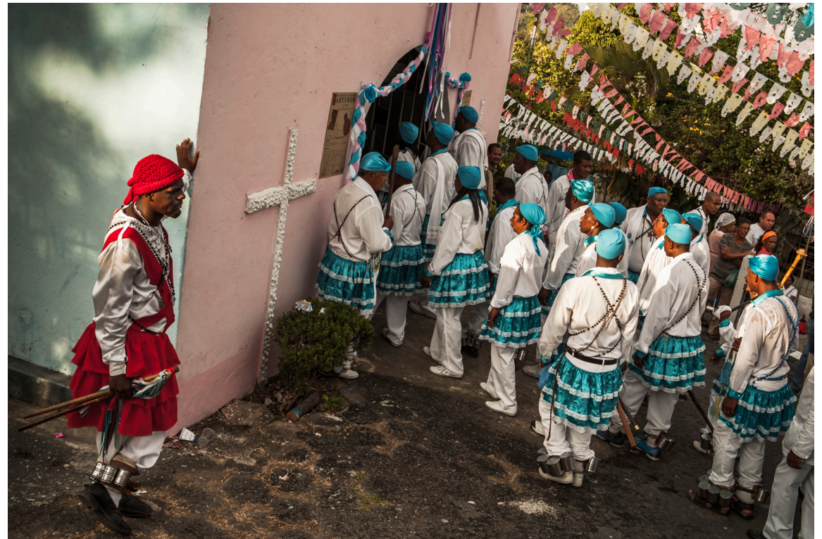
Participants enter a spiritual house in Contagem City during the Liberty Day festivities.