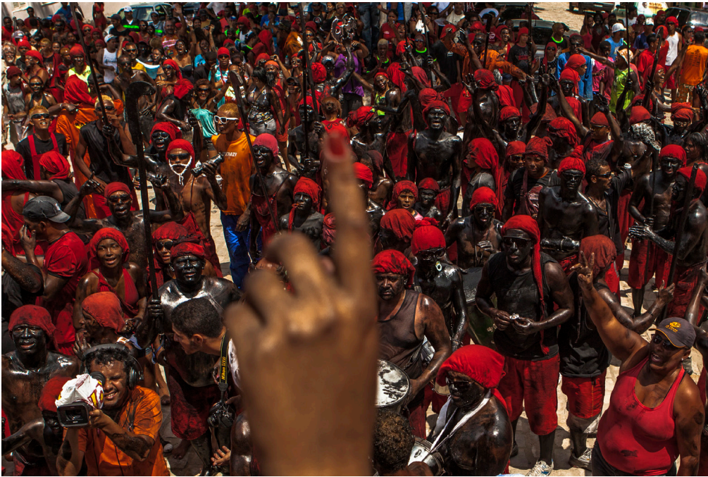
The Lambe Sujo Festival in Laranjeiras City, State of Sergipe, Brazil. This festival mixes dance, music, and theater across the streets of the city and exposes the history of a quilombo, a place of runaway slaves during the colonial period in Brazil.

There are also a number of pagan festivals with the strong presence of the memory of slavery. These rituals are conducted all over the country. Lambe Sujo, which takes place in the small town of Laranjeiras in Sergipe State, and Negro Fugido, which takes place throughout Bahia State, are just two. These festivals commemorate in the streets for an entire day the escape and later imprisonment of a group of slaves. It is a great example of open-air theater, with parades meandering through the streets of the town with a wealth of music and dancing. These festivals take place under other names throughout Northeast Brazil. Despite the vast geographical distances that separate them, the rituals have many elements in common.