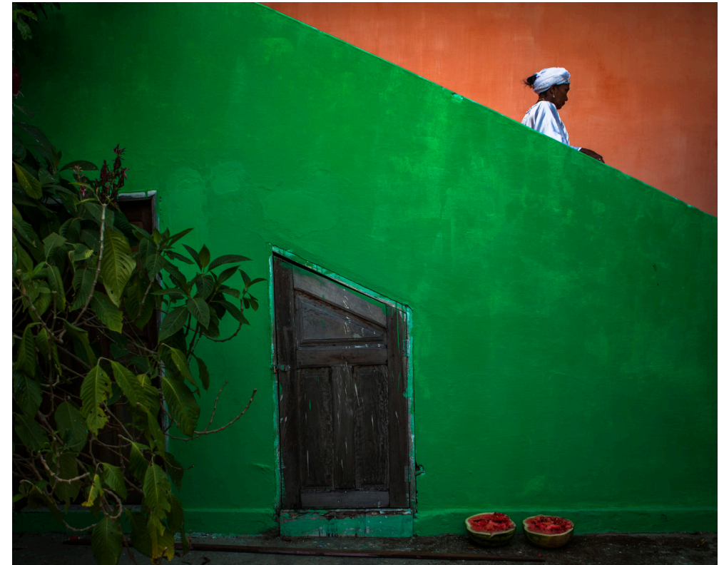
A practitioner descends a stairway at the Rainha Iemanjá spiritual house. Services here are devoted to the Afro-Brazilian cults of Umbanda and Terecô.

There is no uniformity of belief among the followers of Umbanda. Most recognize a supreme deity called Olorum (or Zambi), who has various representations. Umbanda also gives reverence to a number of Catholic saints. Other followers seek interaction with the spirits of the deceased through psychics. Karma and reincarnation are central tenets of the religion.