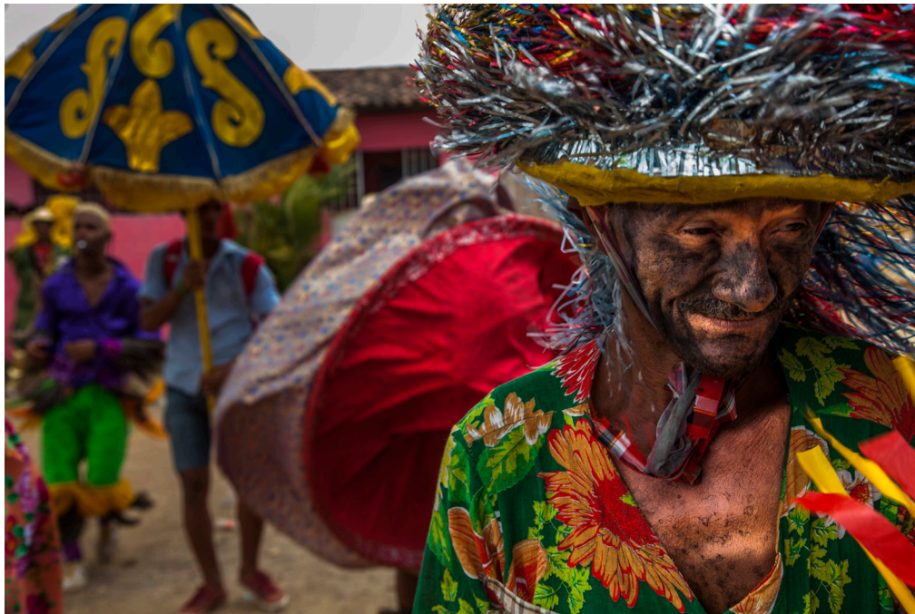
A member of a Maracatu dance troupe in Aliança City during the carnival celebration. (above) Fireworks set off during a celebration of the Brotherhood of Our Lady of the Rosary and Saint Benedict of the Black Man Festival. (right)

Afro-Brazilian subcultures constitute a great deal of the social fabric that is distinctive to Brazil. More African slaves were brought to Brazil than any other country in the world. The sheer numbers changed the demographic structure from which the society evolved. The most expressive forms of these cultures have their roots in the founding of the New World. As colonization continued to expand and diversify, it implanted cultural and religious manifestations that are being renewed and intensified in the present day. The consequences of the African diaspora, have shaped the cultural legacy of Brazil, making it different from any other society. The rituals performed by each group, with their colorful preparations, unite people of white, brown, and black skin. The ceremonies infuse the Brazilian society with a captivating identity. Enriched by combining cultural roots that go back to Africa with native elements, Brazil is vibrant, unique, and a perennially fascinating illustration of the dynamism of diversity.