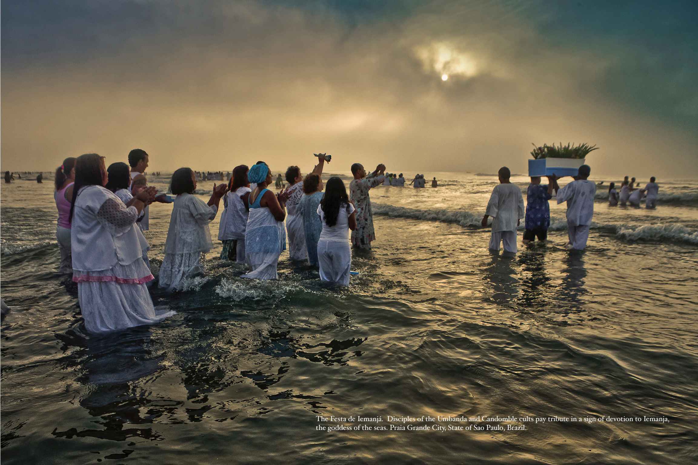
The Festa de Iemanjá. Disciples of the Umbanda and Candomblé cults pay tribute in a sign of devotion to Iemanjá, the goddess of the seas. Praia Grande City, State of São Paulo, Brazil.