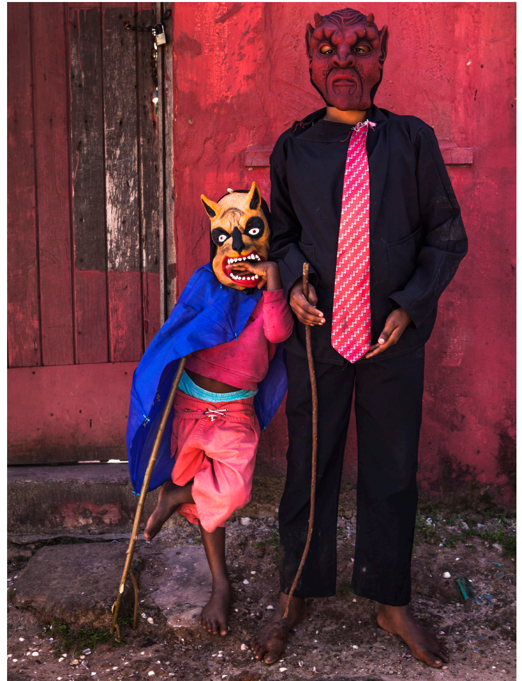
Nego Fugido (the runaway black) and Caretas (masks) Festival in the Acupe District, Santo Amaro da Purificação City, Bahia State, Brazil.

There are also a number of pagan festivals with the strong presence of the memory of slavery. These rituals are conducted all over the country. Lambe Sujo, which takes place in the small town of Laranjeiras in Sergipe State, and Negro Fugido, which takes place throughout Bahia State, are just two. These festivals commemorate in the streets for an entire day the escape and later imprisonment of a group of slaves. It is a great example of open-air theater, with parades meandering through the streets of the town with a wealth of music and dancing. These festivals take place under other names throughout Northeast Brazil. Despite the vast geographical distances that separate them, the rituals have many elements in common.