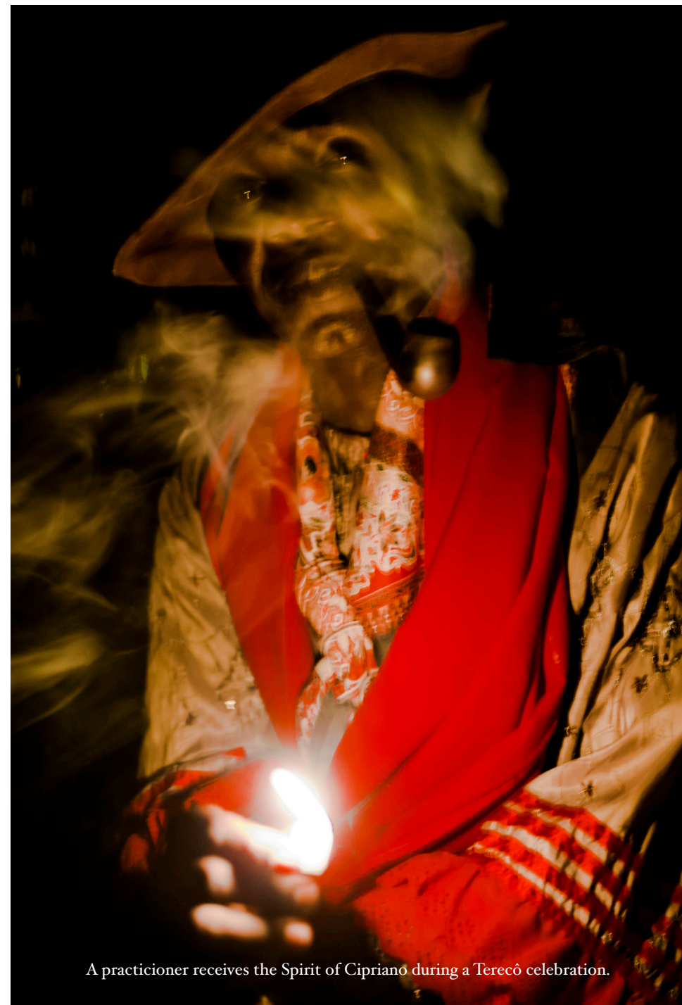
A practitioner receives the Spirit of Cipriano during a Terecô celebration.