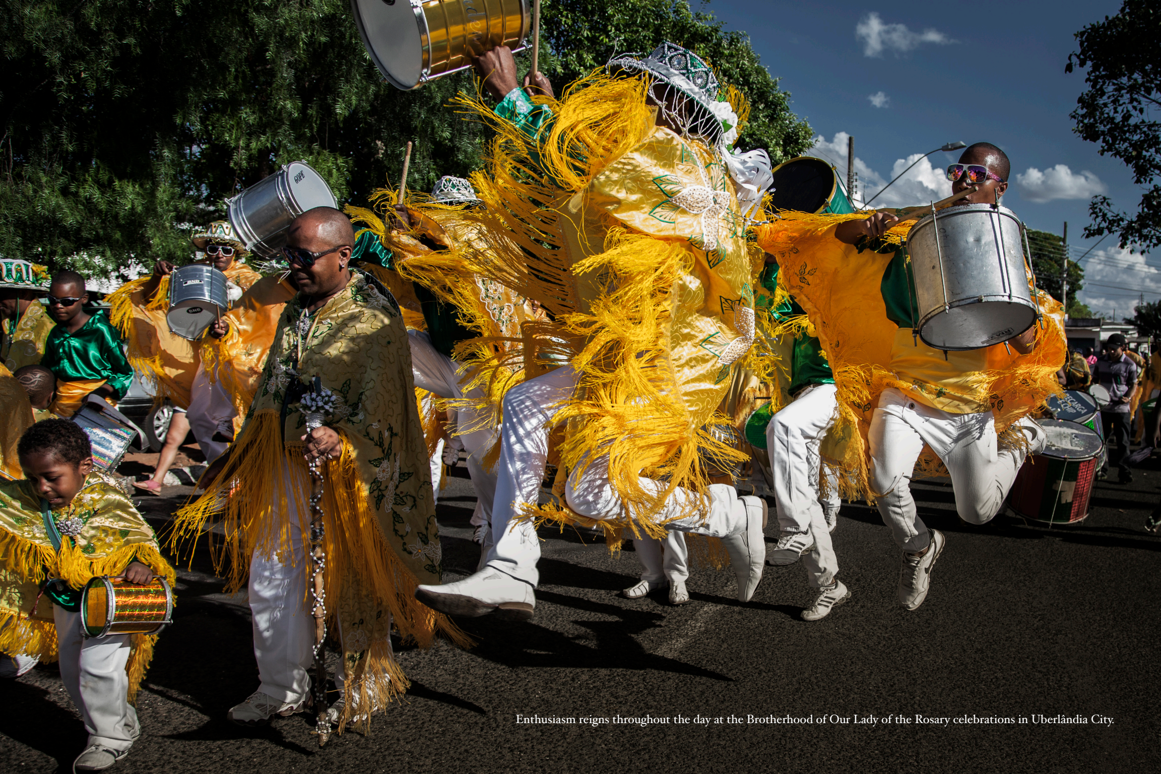
Enthusiasm reigns throughout the day at the Brotherhood of Our Lady of the Rosary celebrations in Uberlândia City.