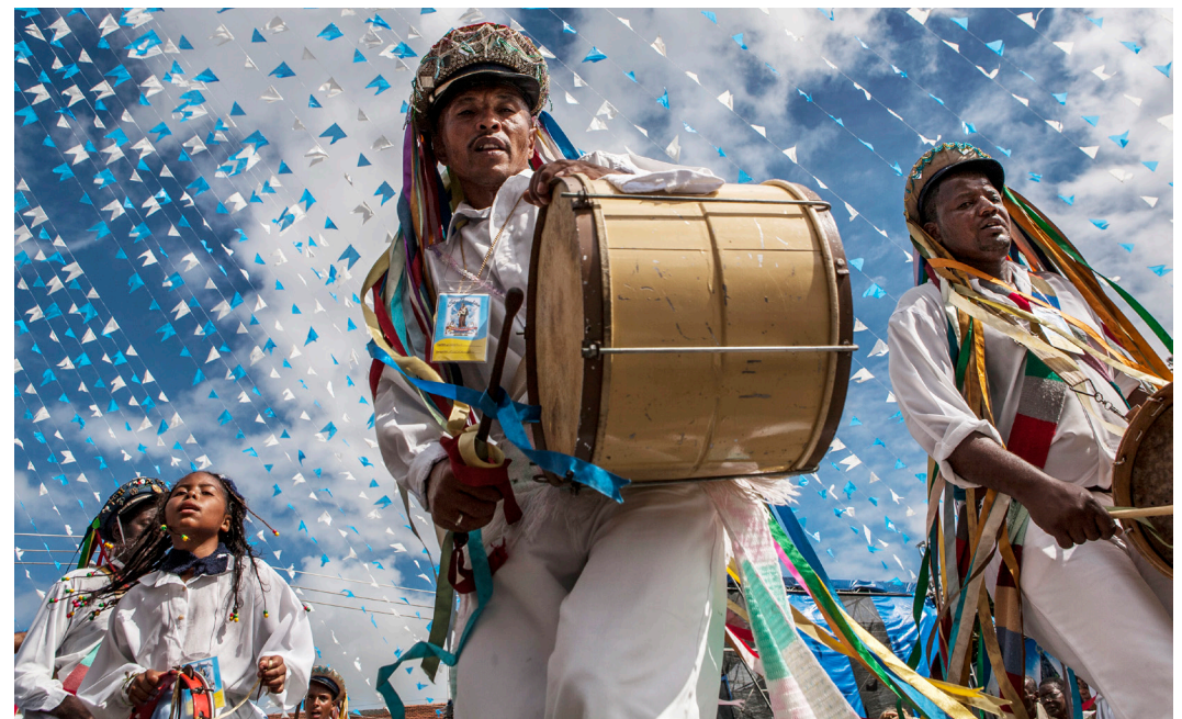
Two girls carry a sculpture of the Virgin and Child during the Brotherhood of Our Lady of the Rosary Feast in Uberlândia City. (top) The celebration of São Benedito Day, named after the black saint of Brazil, begins with a parade in the city of Aparecida. (above)