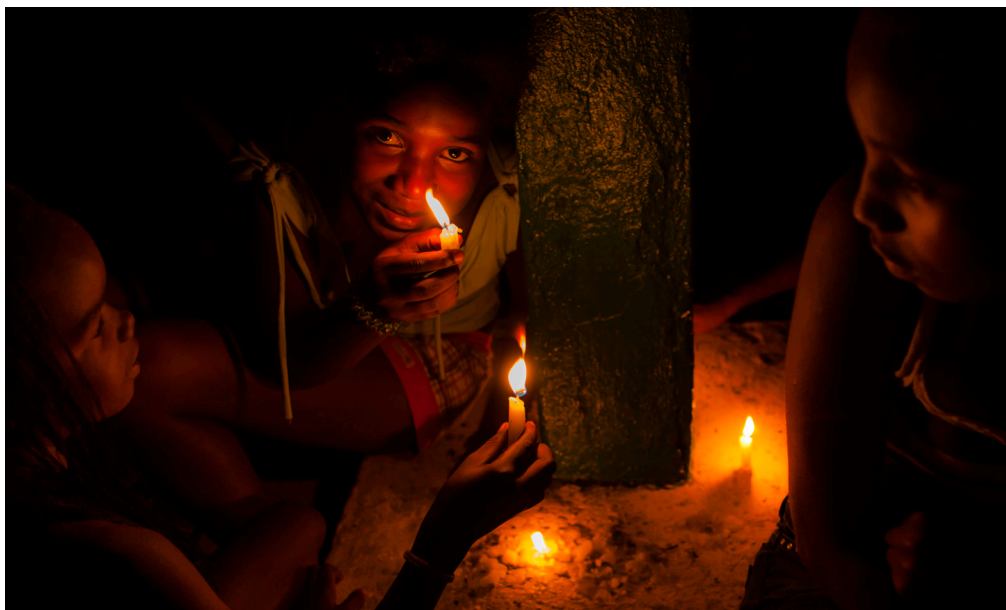
Terecô celebration, during the St. Anthony's Feast, at a black community named Santo Antônio dos Pretos (The Black's Saint Anthony), in Codó City, Brazil. (top left & bottom left)