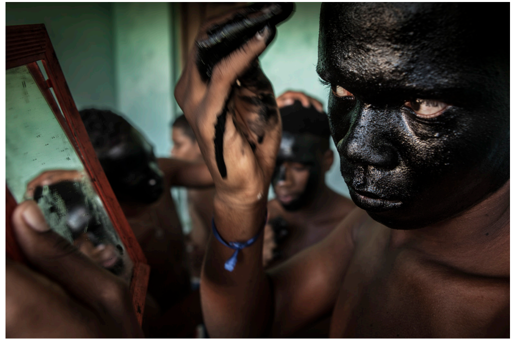
Participants prepare and gather for the beginning of festivities for Nego Fugido in the Acupe District, Santo Amaro da Purificação City, Bahia State, Brazil. (top right)

Participants begin the ceremonies by painting their bodies. This is followed by loud chanting and a procession of chained individuals, symbolizing their enslavement. Often there is a re-enactment of the punishments, beatings, and murders that many had to endure.