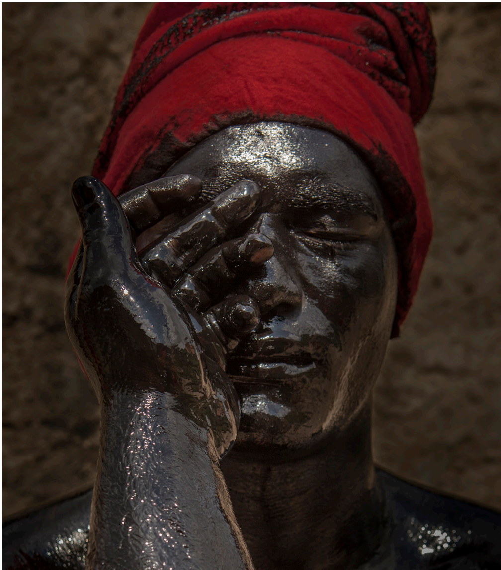
The Lambe Sujo festival in Laranjeiras City, State of Sergipe, Brazil. The festival mixes dance, music and theater to expose the history of quilombo, a place of runaway slaves during the colonial period in Brazil. (above & bottom right)

Participants begin the ceremonies by painting their bodies. This is followed by loud chanting and a procession of chained individuals, symbolizing their enslavement. Often there is a re-enactment of the punishments, beatings, and murders that many had to endure.