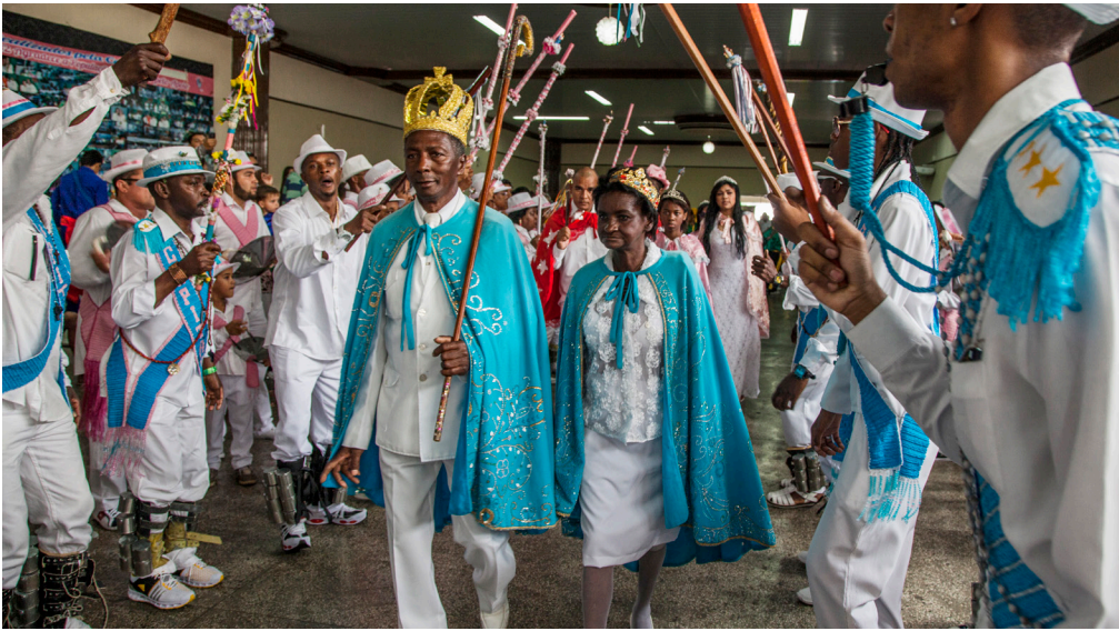
Saint Benedict's Feast celebrations in Catalão City. (above)

The group most influenced by the Catholic traditions is the Irmandade de Nossa Senhora do Rosário (Brotherhood of Our Lady of the Rosary). As an order of the Catholic Church, it was founded in the mid-1600s. The church encouraged the constitution of brotherhoods as a means of spreading the gospel among the free population as well as the black and mulatto Christianized slaves. These lay associations brought together people according to color and ethnic and status criteria. Brotherhoods served the purpose of self-affirmation for slaves and freed persons, but they were also used by elites as a tool of social control. 2