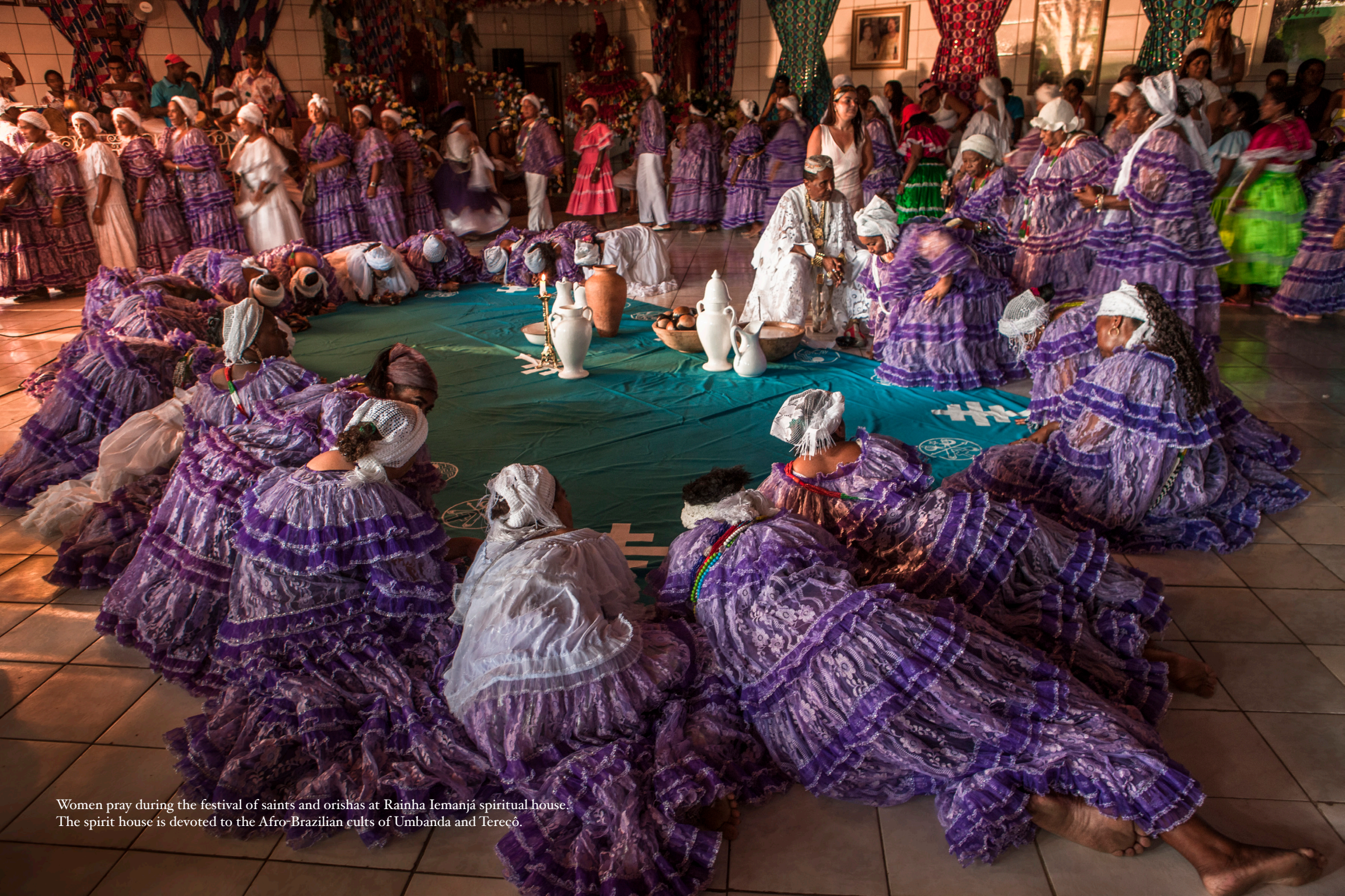
Women pray during the festival of saints and orishas at Rainha Iemanjá spiritual house. The spirit house is devoted to the Afro-Brazilian cults of Umbanda and Terecô.