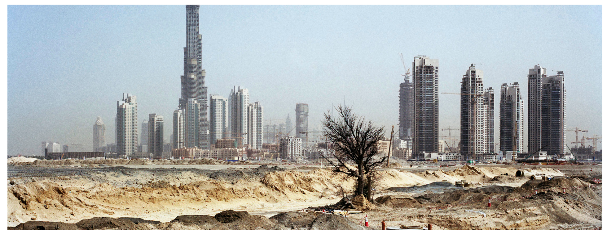
Dubai's downtown area rises out of the desert.

The break is over and it's back to the top story for Kaleem. "I'm proud to take part in the construction of the biggest house in the world," he says. After its completion this year, the Burj Dubai will measure well over 3,280 feet in height. The building's owners are keeping the exact height a secret. The building site is cluttered with the swinging arms of cranes, which move through the air like tentacles and swing their loads past the wispy clouds hanging in the surrounding sky. One out of every six cranes in the world is in Dubai.