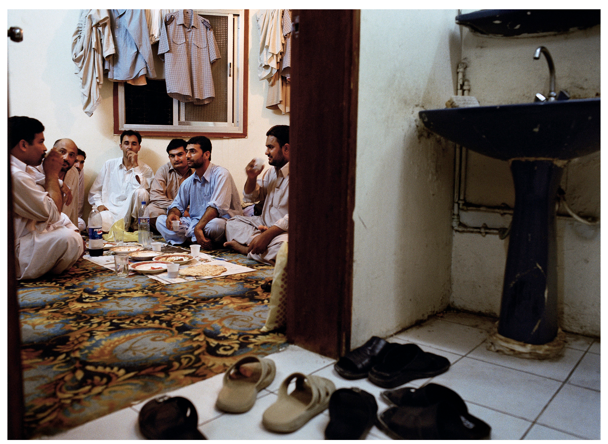
These Pakistani men sit down for a dinner after a day on construction site. Twelve people share this one small apartment.