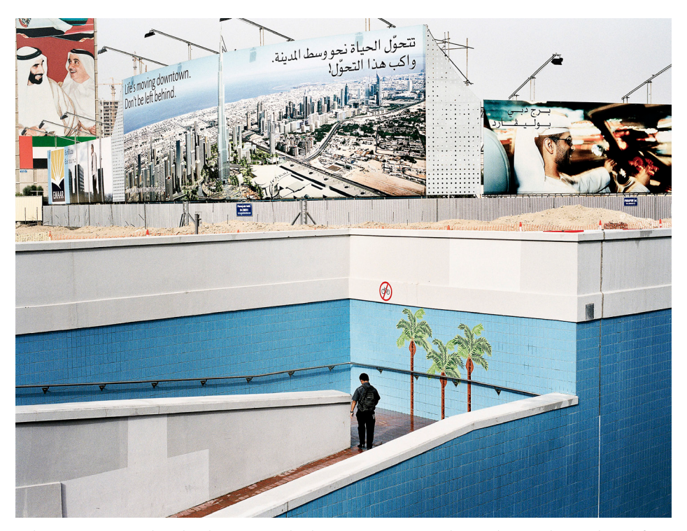
The city is covered with advertising which is pure irony in relationship to the workers lifes.