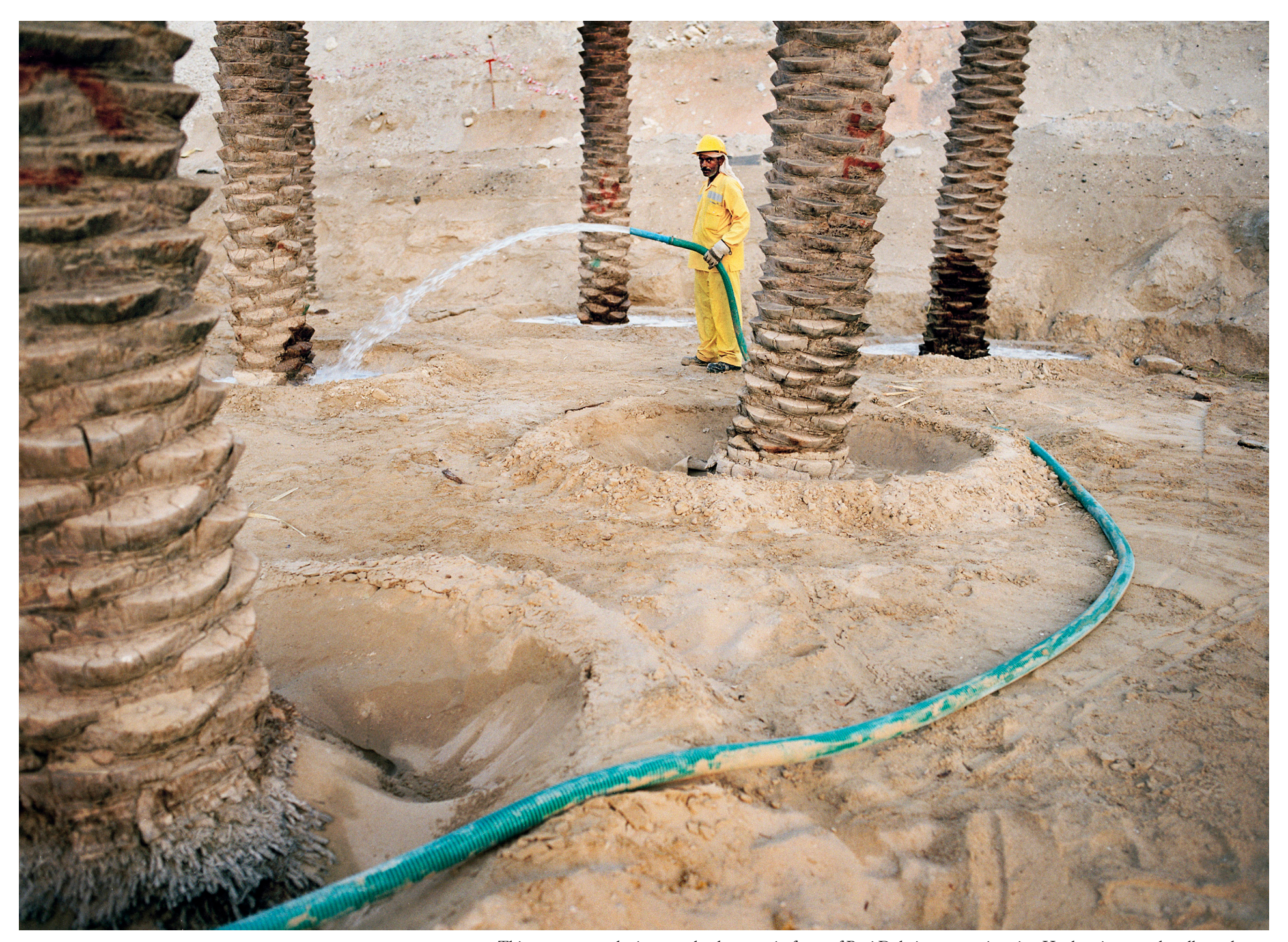
This man waters the imported palm trees in front of Burj Dubai construction site. He does it every day all year long.