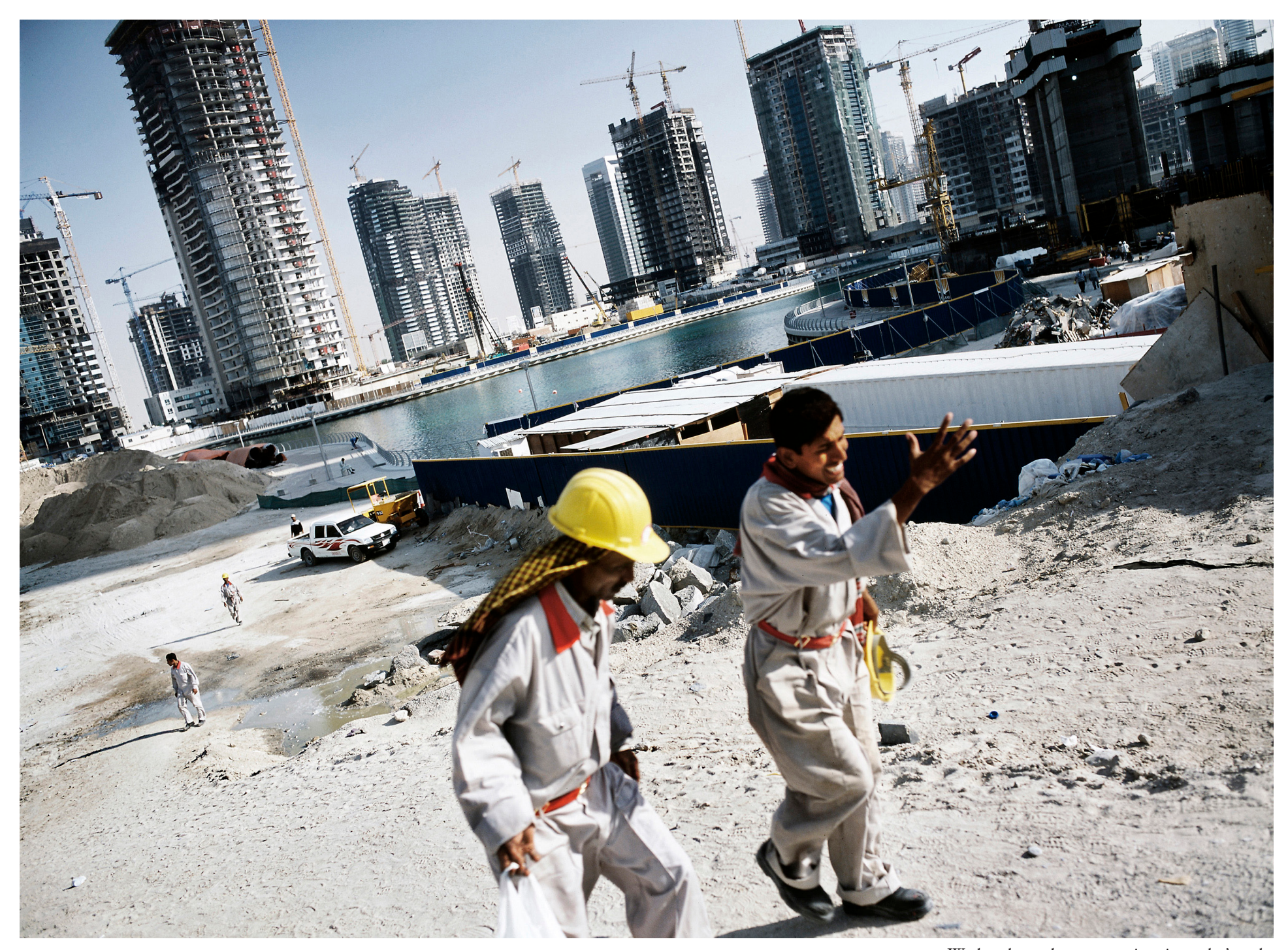
Workers leave the construction site at day's end.