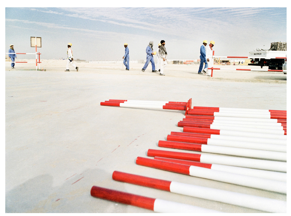
Dubai is dominated by the colors red and white.

Not far from Palm Island is the Dubai Marina, a "marina of superlatives." There, for a change, one will find no foreign laborers. This is a place of conspicuous consumption. The windshields of the cars are tinted, as if those inside are important. Emirates with flowing caftans and waving scarves stroll across the boardwalks, children play in the fountains, and tourists eat in outrageously expensive restaurants or smoke hookahs. The Sheesha sits in the body of the hookah pipe, connected to the guests by hoses that sprout from it as if it were a beast with many heads. This beast blubbers and gurgles like a clogged drain. "Such is Dubai: Decadent and unhurried," says Ali, a local who works in city administration. The citizens are known for not doing labor; most of them work as civil servants or in state enterprises. They represent power, while Kaleem from India or the ironworker with the shark teeth on Palm Island represent impotence.