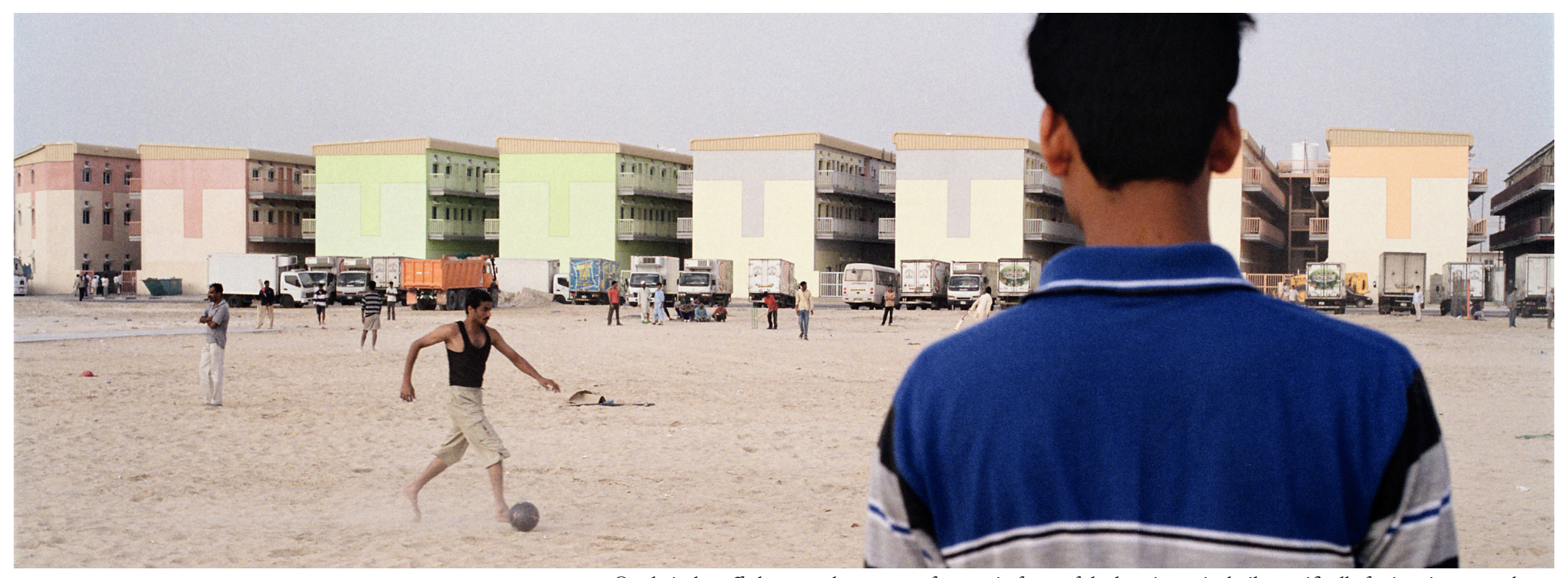
On their day off, the men play a game of soccer in front of the housing units built specifically for immigrant workers.