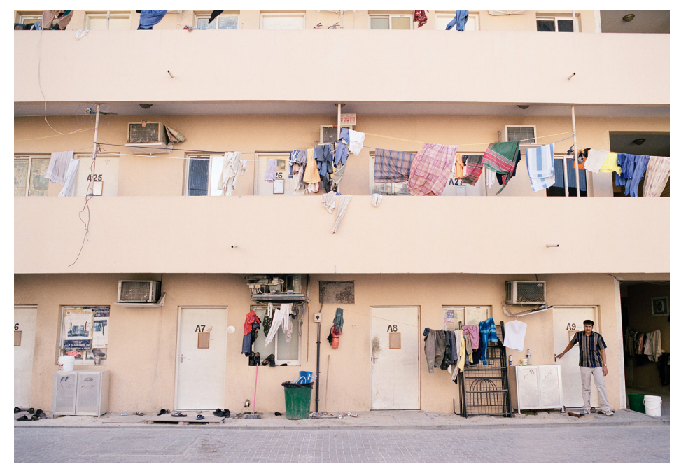
Workers live in housing that is over-crowded and squalid.