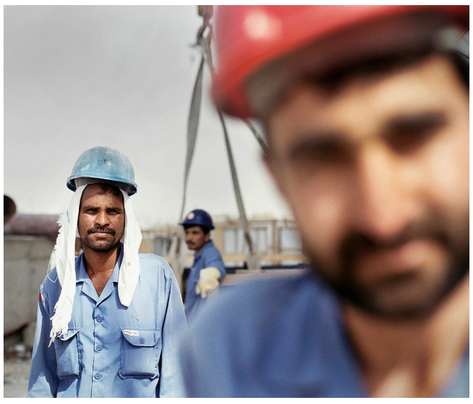
There are over 50,000 millionaires among 200,000 locals. The average income of a construction worker is $180 a month.

Ninety percent of Dubai's 1.6 million residents are foreigners, some of whom are businessmen, playboys, or those who have immigrated out of a sense of adventure. The majority, however, are poorly-paid foreign laborers. In a few decades, Dubai has transformed into an Arab "world city." It produces neither large quantities of oil nor terrorists; rather it sells dreams. In addition to a shopping mall with a ski slope, Dubai has five-star hotels like the Burj-al-Arab, built in the shape of a solar sail, and a group of islands, recognizable—from space - as a map of the world.