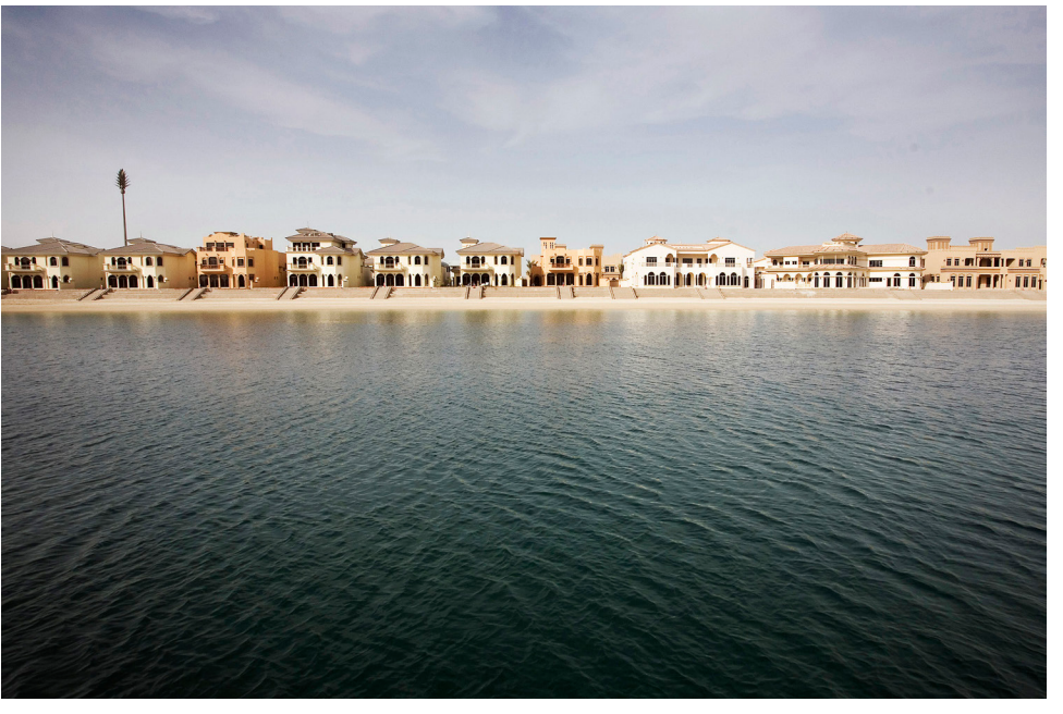
The community of Palm Jumeirah.