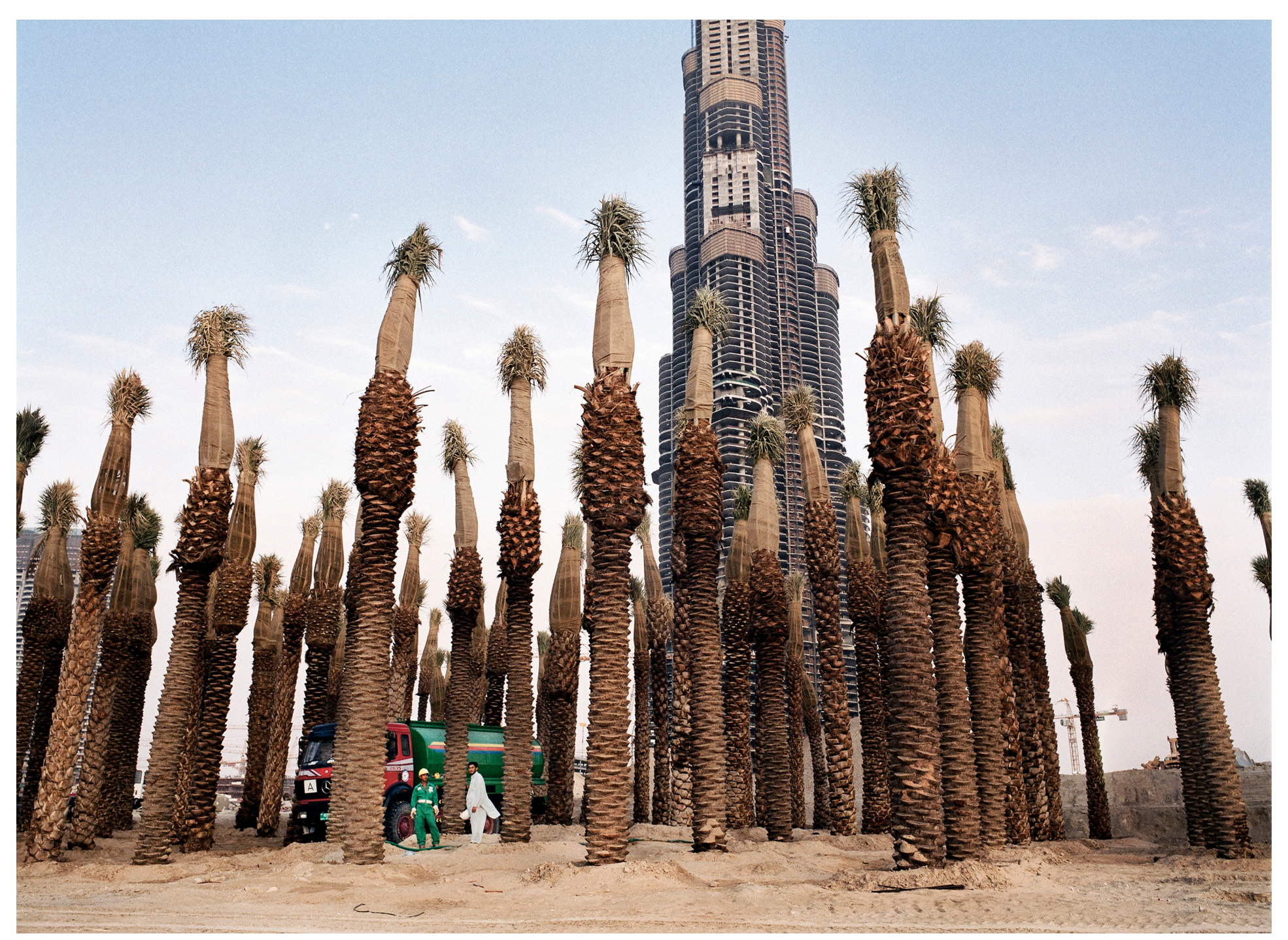
The Burj Dubai building. It will become the highest building in the World, over 800 meters high.