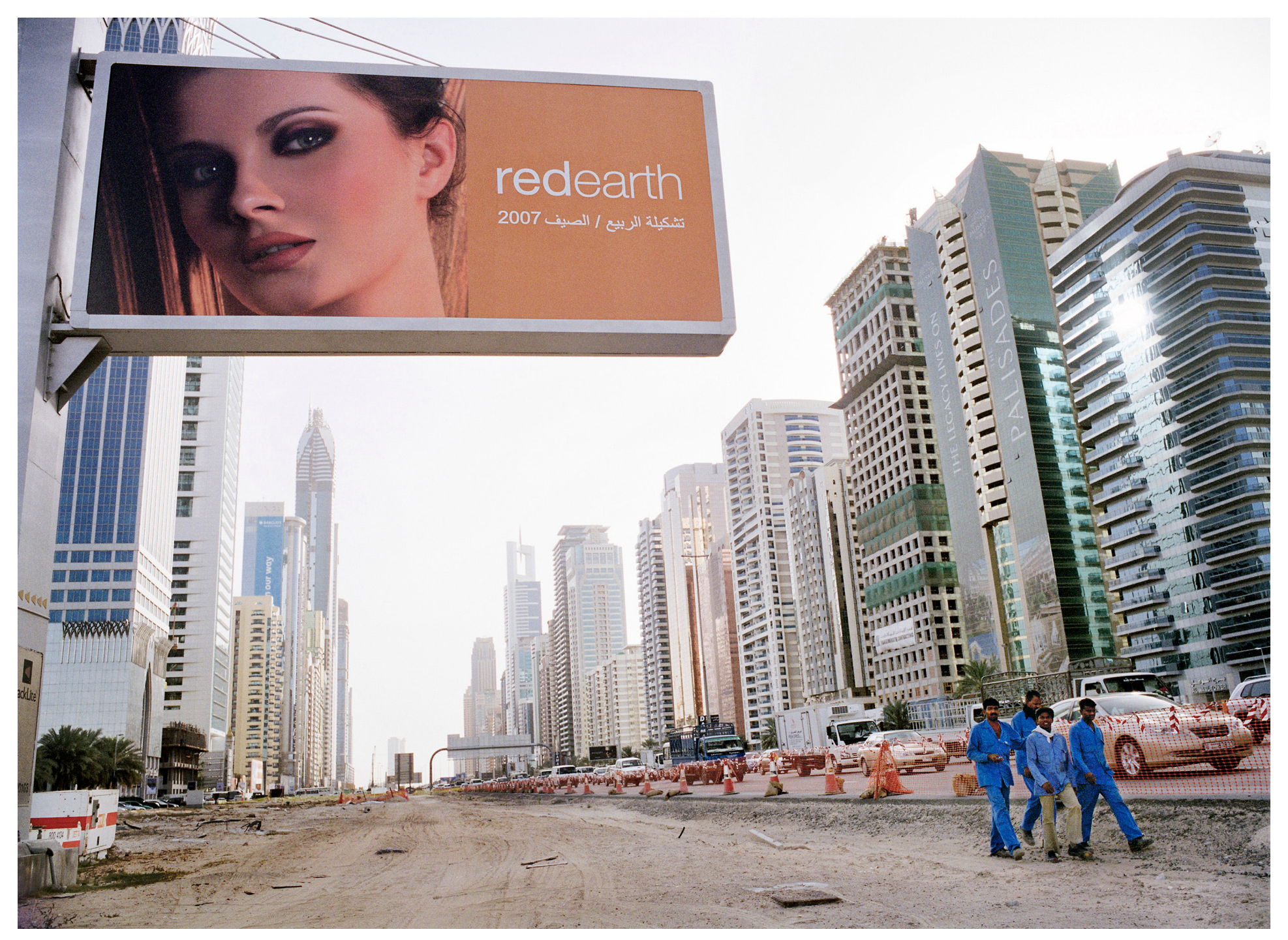
Sheik Zayed Road is the main traffic thoroughfare through new Dubai. Workers are expanding it to ten lanes.