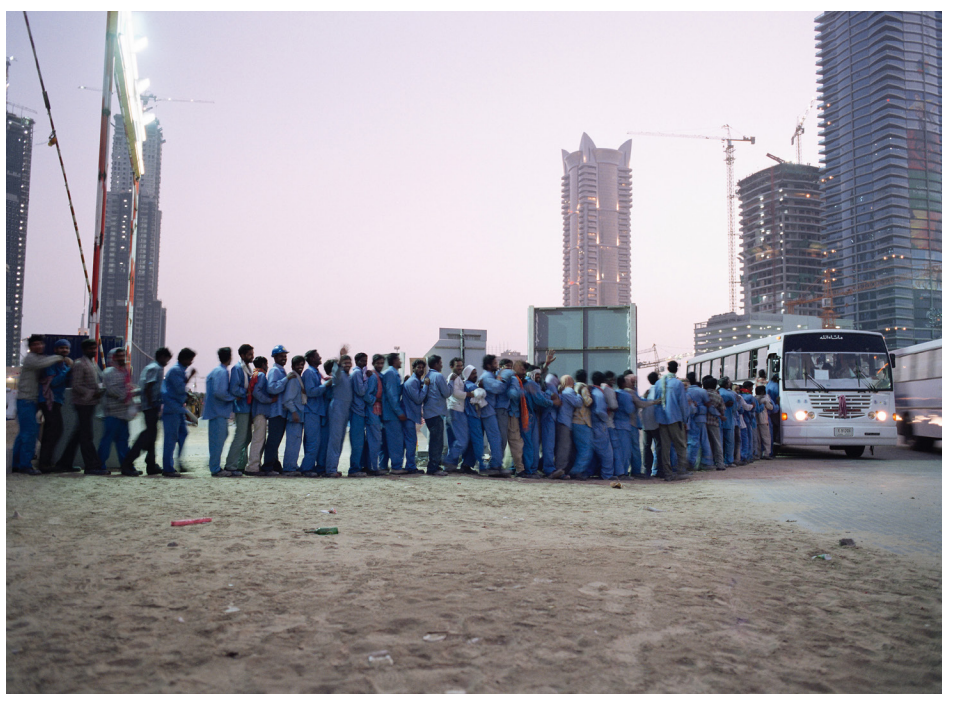
Men leave the construction site and are bused to housing built specifically for them.

to Dubai. After a physical examination, he got his visa and a plane ticket, which he has paid off in installments over the last three years.