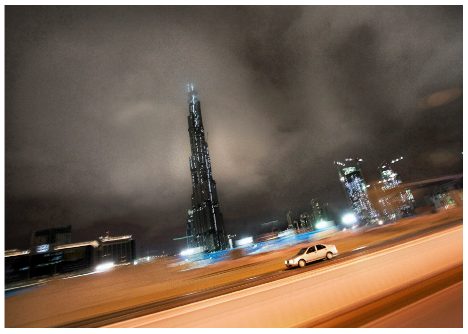
Burj Dubai at night, driving on Sheik Zayed Road.

At a cost of over $1.8 billion U.S., the Burj has been more expensive than the citizens of Dubai expected. Two thousand and four hundred foreign workers labor here daily in two shifts. The fifty-four double-decker elevators will travel fifty-nine feet per second and the cooling system will give off more cold air than 9,000 metric tons of melting ice per day. The one-hundred and sixty stairways are fireproofed, which after 9/11 has proven necessary. One-thousand palm trees with fluttering crowns will soon be planted around the building. Everything has a Tower of Babel quality to it.