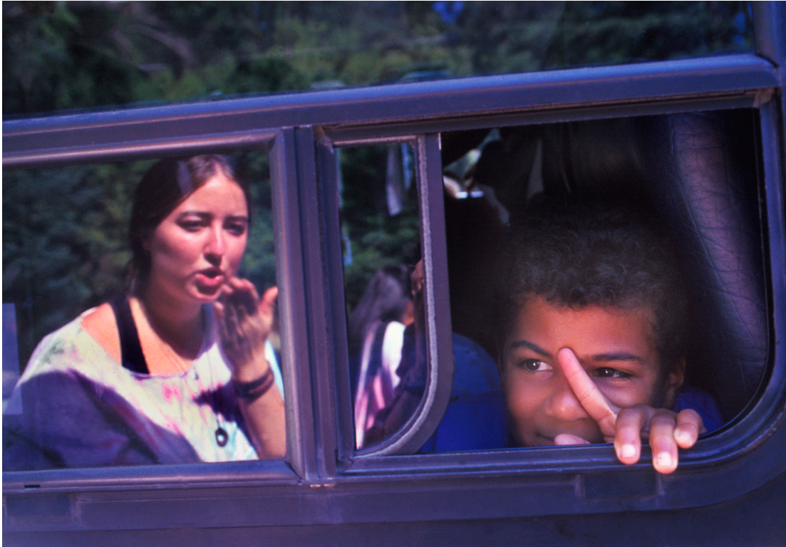
Counselor blows a goodbye kiss to a departing child.

Approximately, every thirteen seconds someone new is infected with HIV. Today there are more than thirty million adults are infected with the virus. Another 2.5 million children are infected with the disease. To date, the epidemic has left behind 15.2 AIDS orphans.