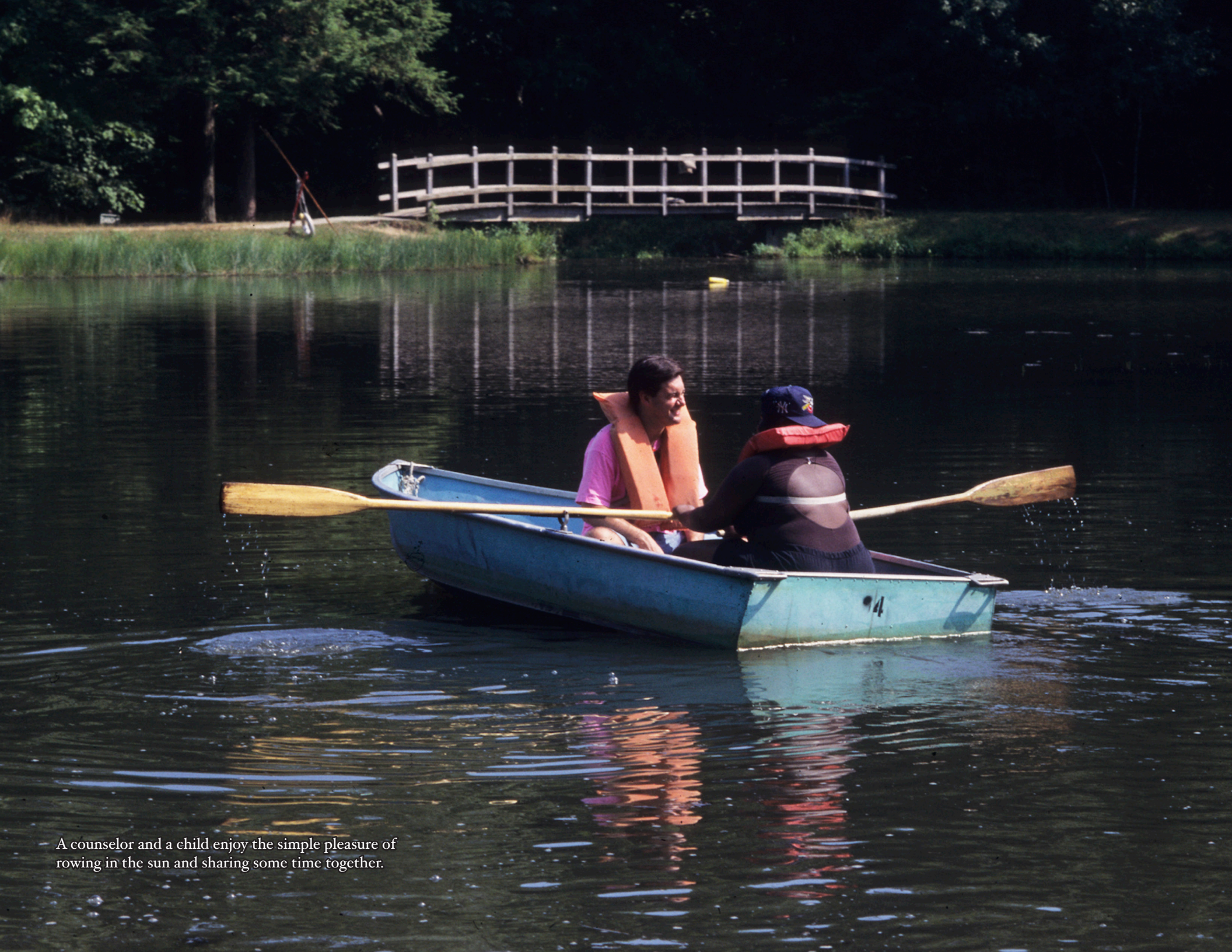
A counselor and a child enjoy the simple pleasure of rowing in the sun and sharing some time together.